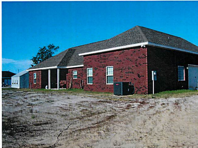
7 MAY 2013 – REAR VIEW