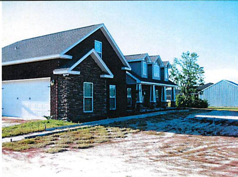
7 MAY 2013 – FRONT VIEW

If using the Elevation Certificate to obtain NFIP flood insurance, affix at least two building photographs below according to the instructions for Item A6. Identify all photographs with: date taken; "Front View" and "Rear View"; and, if required, "Right Side View" and "Left Side View." If submitting more photographs than will fit on this page, use the Continuation Page on the reverse.