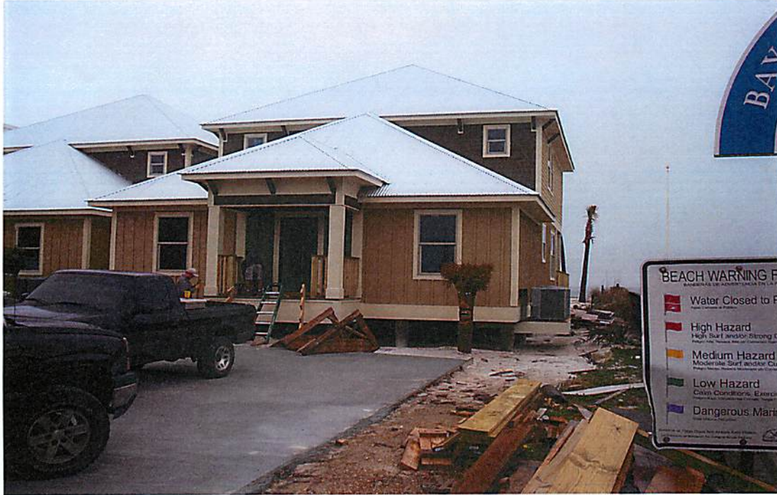
REAR VIEW 02/12/13