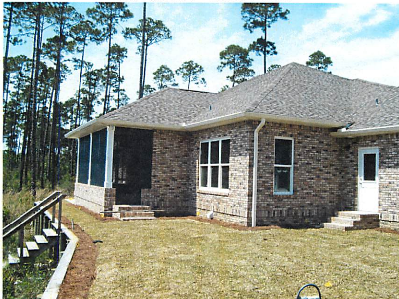
4 APRIL 2014 -- REAR VIEW