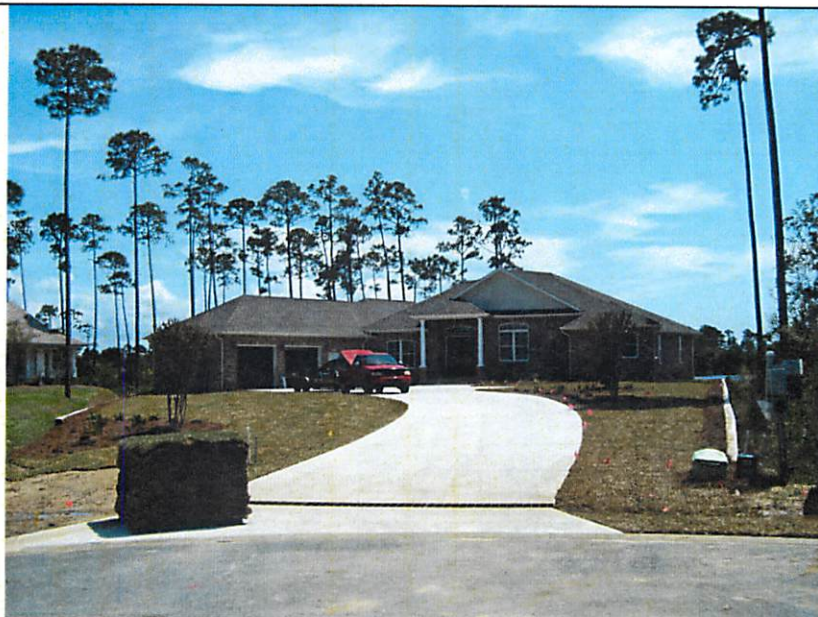
4 APRIL 2014 -- FRONT VIEW

If using the Elevation Certificate to obtain NFIP flood insurance, affix at least 2 building photographs below according to the instructions for Item A6. Identify all photographs with date taken; "Front View" and "Rear View"; and, if required, "Right Side View" and "Left Side View." When applicable, photographs must show the foundation with representative examples of the flood openings or vents, as indicated in Section A8. If submitting more photographs than will fit on this page, use the Continuation Page.