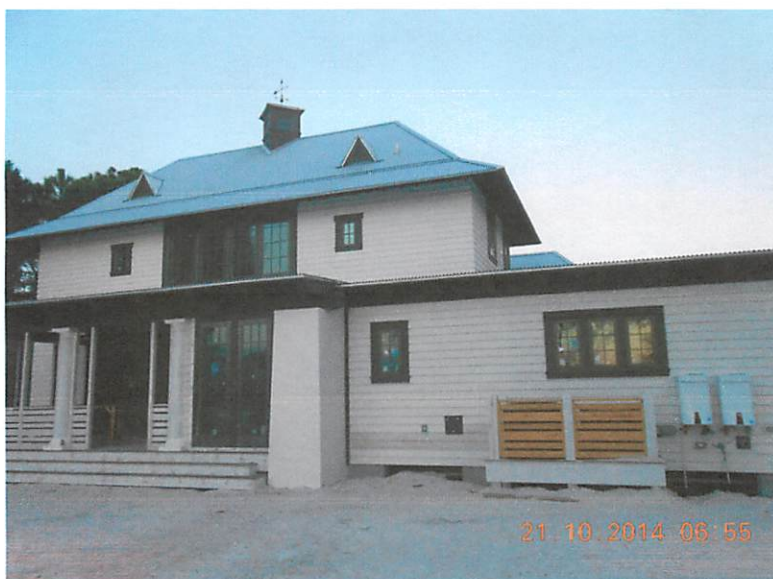
Rear View 10.21.2014