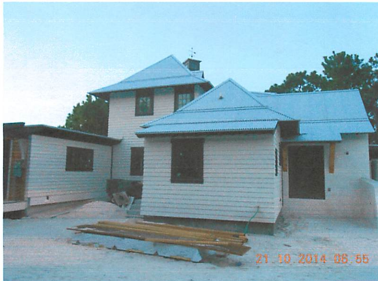
Left Side View 10.21.2014