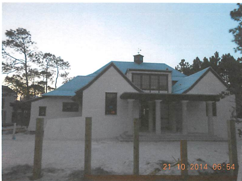
Front View 10.21.2014

If using the Elevation Certificate to obtain NFIP flood insurance, affix at least 2 building photographs below according to the instructions for Item A6. Identify all photographs with date taken; "Front View" and "Rear View"; and, if required, "Right Side View" and "Left Side View." When applicable, photographs must show the foundation with representative examples of the flood openings or vents, as indicated in Section A8. If submitting more photographs than will fit on this page, use the Continuation Page.