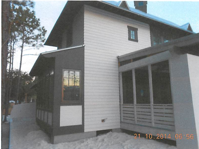
Right Side View 10.21.2014

If submitting more photographs than will fit on the preceding page, affix the additional photographs below. Identify all photographs with: date taken; "Front View" and "Rear View"; and, if required, "Right Side View" and "Left Side View." When applicable, photographs must show the foundation with representative examples of the flood openings or vents, as indicated in Section A8.