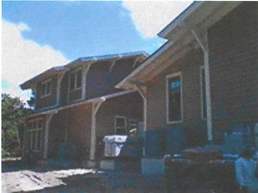
Right Side View 08/26/2014

If submitting more photographs than will fit on the preceding page, affix the additional photographs below. Identify all photographs with: date taken; "Front View" and "Rear View"; and, if required, "Right Side View" and "Left Side View." When applicable, photographs must show the foundation with representative examples of the flood openings or vents, as indicated in Section A8.