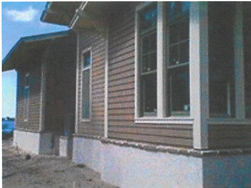
Left Side View 08/26/2014