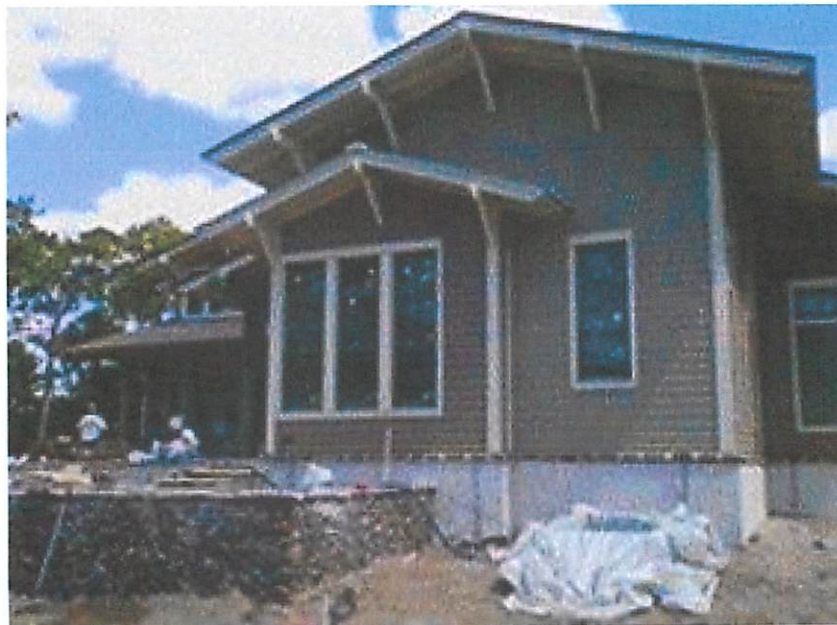
Rear View 08/26/2014