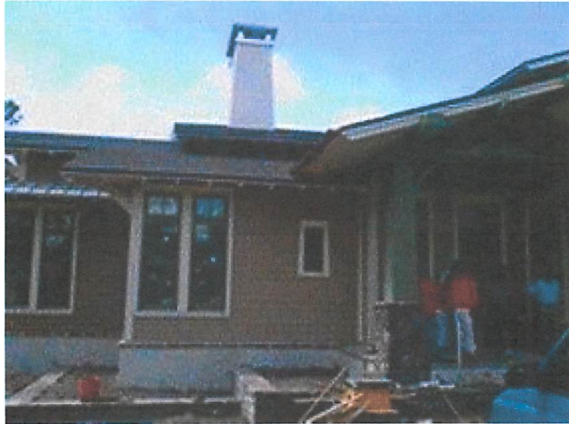
Front View 08/26/2014

If using the Elevation Certificate to obtain NFIP flood insurance, affix at least 2 building photographs below according to the instructions for Item A6. Identify all photographs with date taken; "Front View" and "Rear View"; and, if required, "Right Side View" and "Left Side View." When applicable, photographs must show the foundation with representative examples of the flood openings or vents, as indicated in Section A8. If submitting more photographs than will fit on this page, use the Continuation Page.