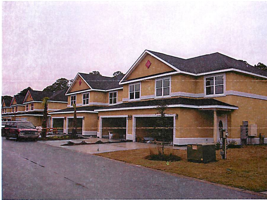
FRONT VIEW (7-12-13)

If using the Elevation Certificate to obtain NFIP flood insurance, affix at least two building photographs below according to the instructions for Item A6. Identify all photographs with: date taken; "Front View" and "Rear View"; and, if required, "Right Side View" and "Left Side View." If submitting more photographs than will fit on this page, use the Continuation Page, following.