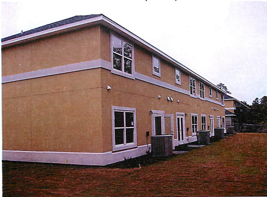
REAR VIEW (7-12-13)