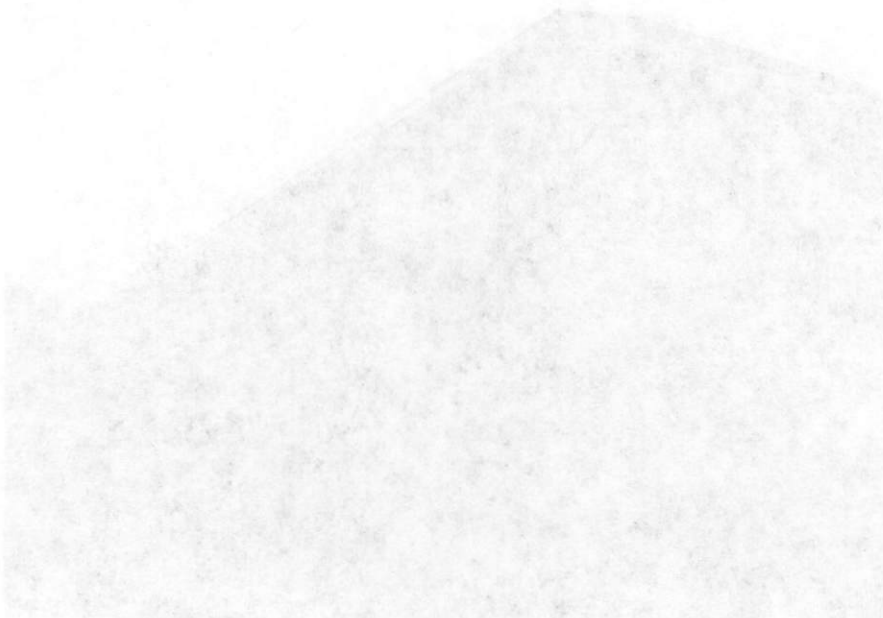
REAR VIEW (DATE)