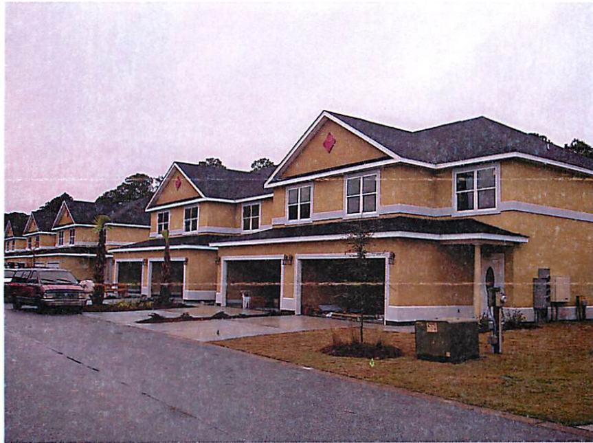
FRONT VIEW (7-12-13)

If using the Elevation Certificate to obtain NFIP flood insurance, affix at least two building photographs below according to the instructions for Item A6. Identify all photographs with: date taken; "Front View" and "Rear View"; and, if required, "Right Side View" and "Left Side View." If submitting more photographs than will fit on this page, use the Continuation Page, following.