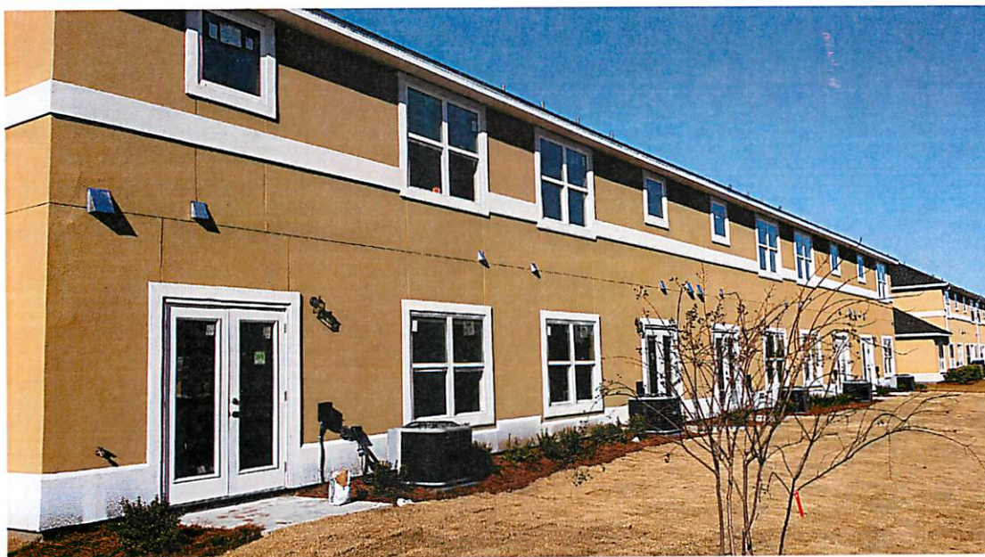
REAR VIEW (12-02-14)