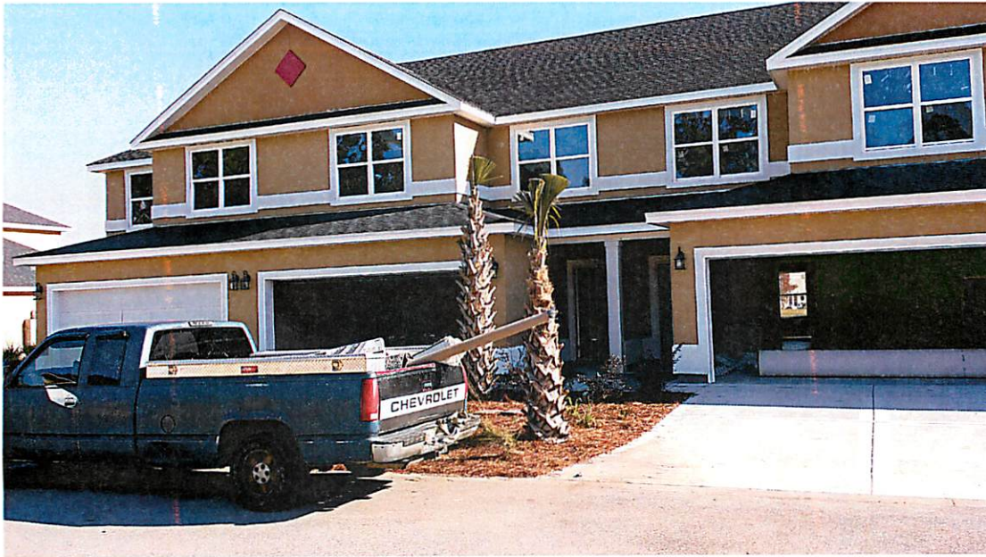
FRONT VIEW (12-02-14)

If using the Elevation Certificate to obtain NFIP flood insurance, affix at least two building photographs below according to the instructions for Item A6. Identify all photographs with: date taken; "Front View" and "Rear View"; and, if required, "Right Side View" and "Left Side View." If submitting more photographs than will fit on this page, use the Continuation Page, following.