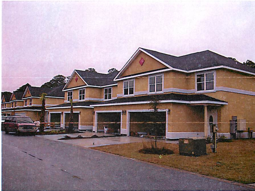
FRONT VIEW (7-12-13)

If using the Elevation Certificate to obtain NFIP flood insurance, affix at least two building photographs below according to the instructions for Item A6. Identify all photographs with: date taken; "Front View" and "Rear View"; and, if required, "Right Side View" and "Left Side View." If submitting more photographs than will fit on this page, use the Continuation Page, following.