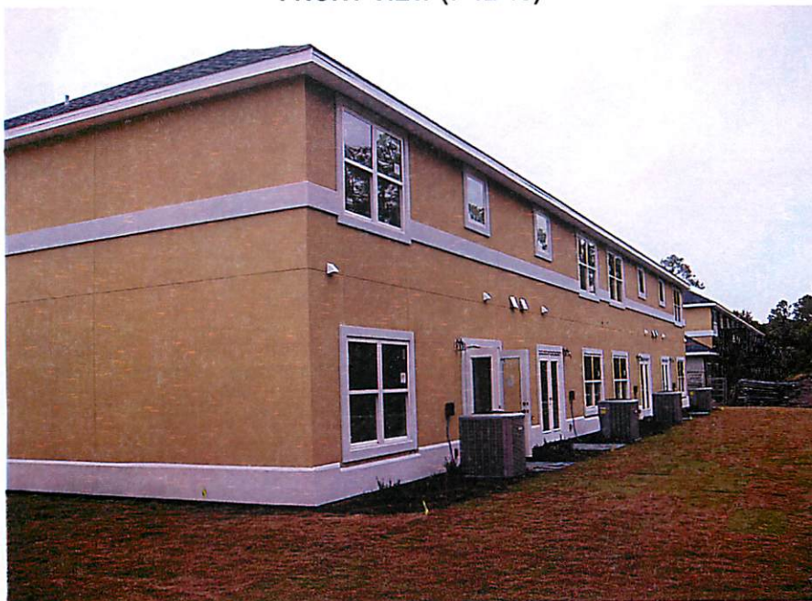
REAR VIEW (7-12-13)