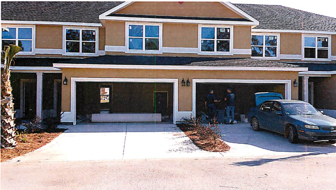
FRONT VIEW (12-02-14)

If using the Elevation Certificate to obtain NFIP flood insurance, affix at least two building photographs below according to the instructions for Item A6. Identify all photographs with: date taken; "Front View" and "Rear View"; and, if required, "Right Side View" and "Left Side View." If submitting more photographs than will fit on this page, use the Continuation Page, following.