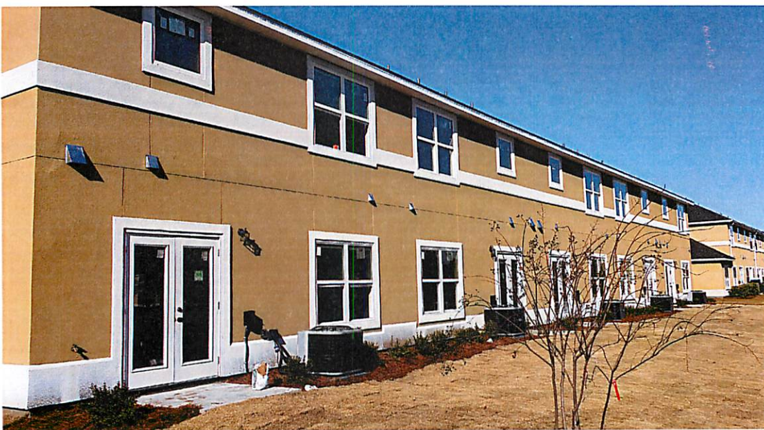
REAR VIEW (12-02-14)