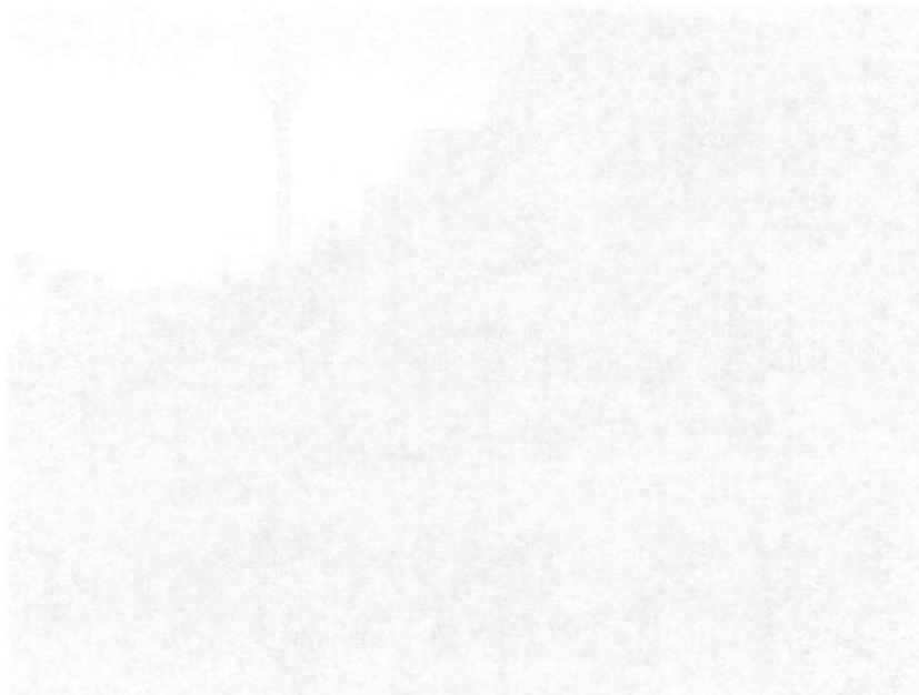
(11-15-05) WBIV THORP

If submitting more photographs than will fit on the preceding page, affix the additional photographs below. Identify all photographs with: date taken; "Front View" and "Rear View"; and, if required, "Right Side View" and "Left Side View."