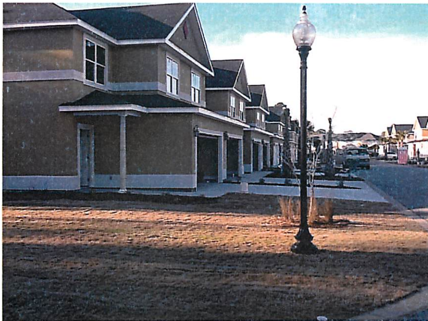
FRONT VIEW (2-21-14)

If using the Elevation Certificate to obtain NFIP flood insurance, affix at least two building photographs below according to the instructions for Item A6. Identify all photographs with: date taken; "Front View" and "Rear View"; and, if required, "Right Side View" and "Left Side View." If submitting more photographs than will fit on this page, use the Continuation Page, following.