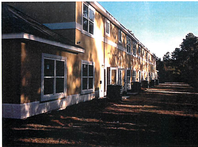
REAR VIEW (2-21-14)