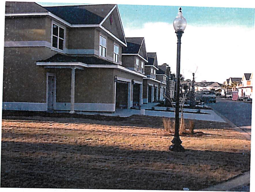
FRONT VIEW (2-21-14)

If using the Elevation Certificate to obtain NFIP flood insurance, affix at least two building photographs below according to the instructions for Item A6. Identify all photographs with: date taken; "Front View" and "Rear View"; and, if required, "Right Side View" and "Left Side View." If submitting more photographs than will fit on this page, use the Continuation Page, following.