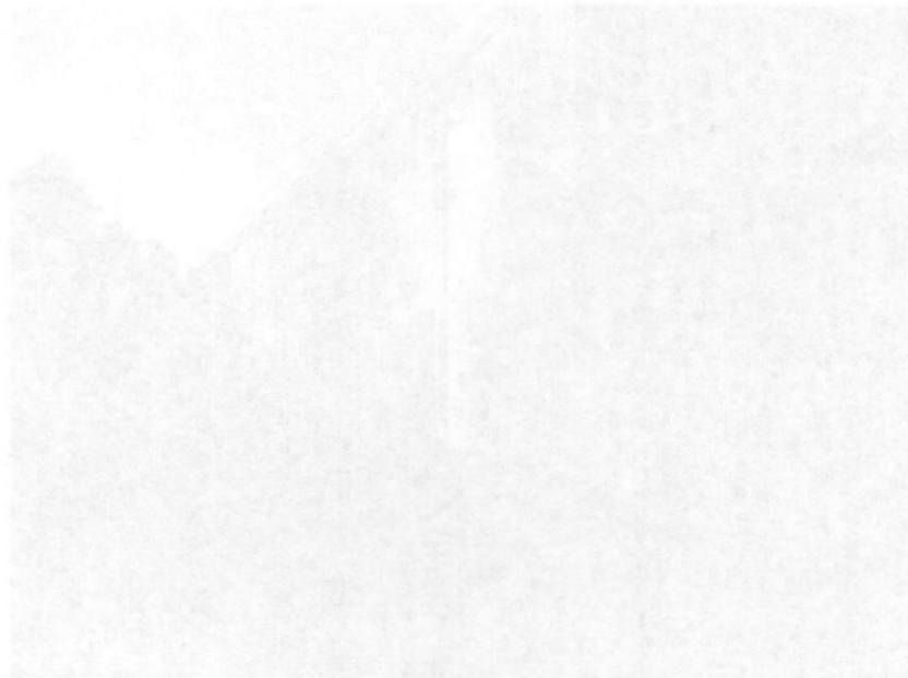
(01-18-03) VIEW REAR