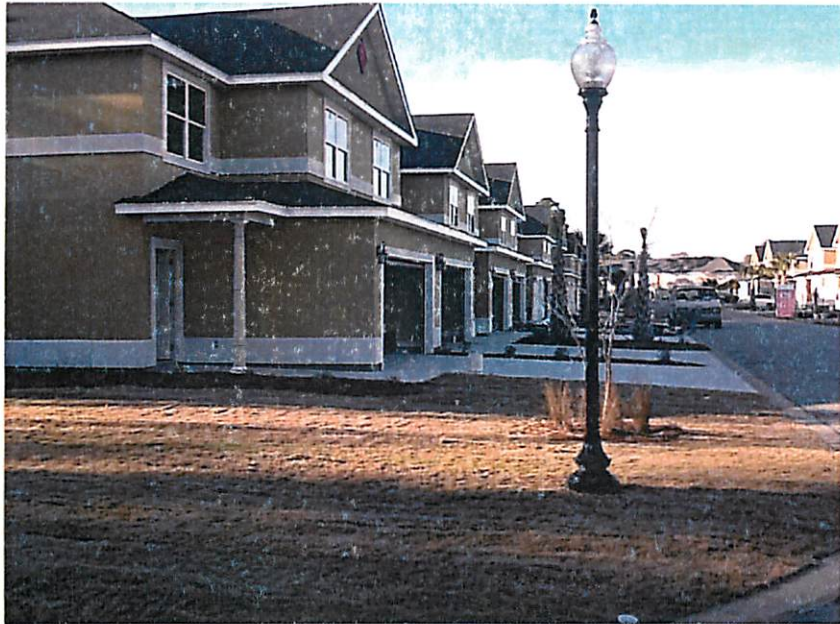
FRONT VIEW (2-21-14)

If using the Elevation Certificate to obtain NFIP flood insurance, affix at least two building photographs below according to the instructions for Item A6. Identify all photographs with: date taken; "Front View" and "Rear View"; and, if required, "Right Side View" and "Left Side View." If submitting more photographs than will fit on this page, use the Continuation Page, following.