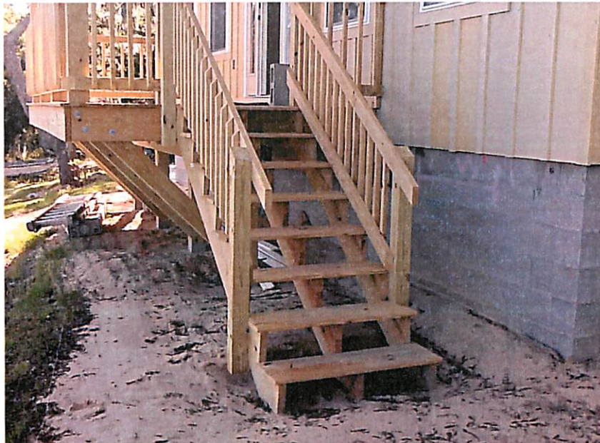
REAR VIEW (4-10-14)