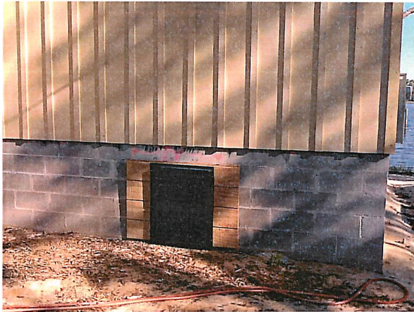
FRONT VIEW (4-10-14)

If using the Elevation Certificate to obtain NFIP flood insurance, affix at least two building photographs below according to the instructions for Item A6. Identify all photographs with: date taken; "Front View" and "Rear View"; and, if required, "Right Side View" and "Left Side View." If submitting more photographs than will fit on this page, use the Continuation Page, following.