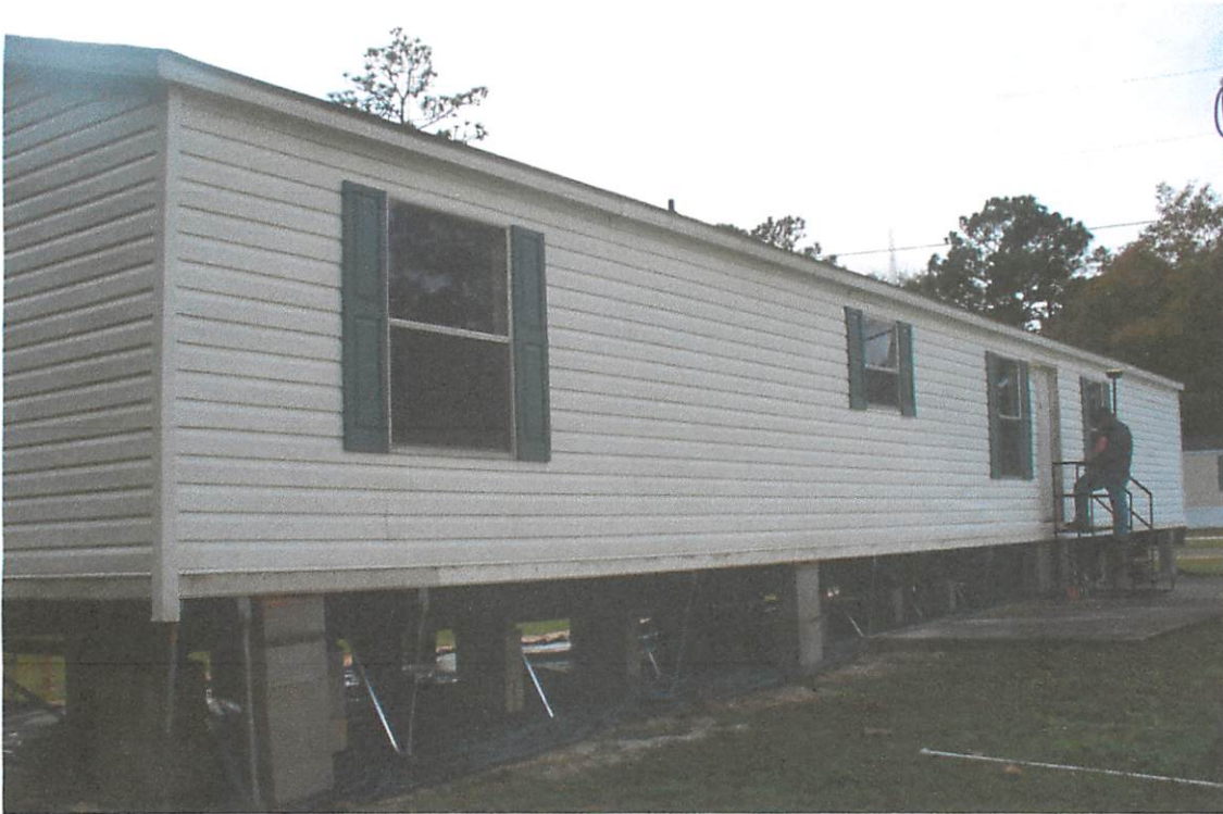
West Side/Road View