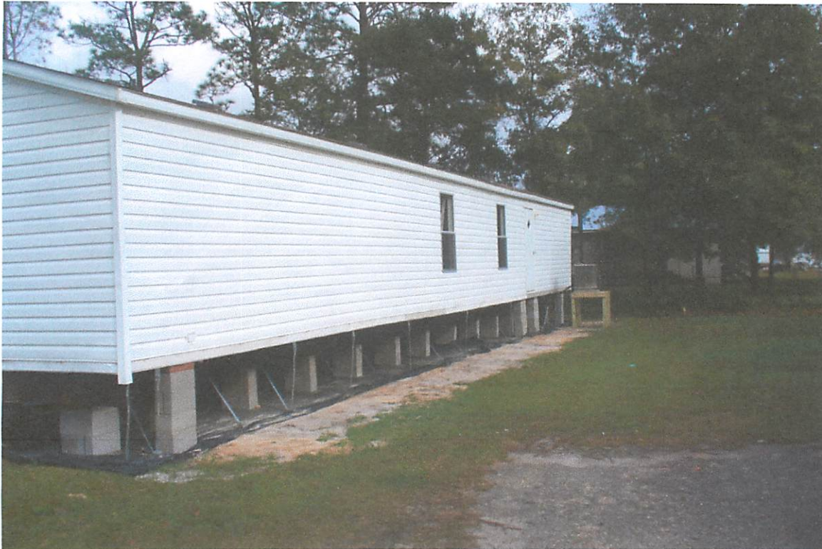
Right Side View with HVAC Unit