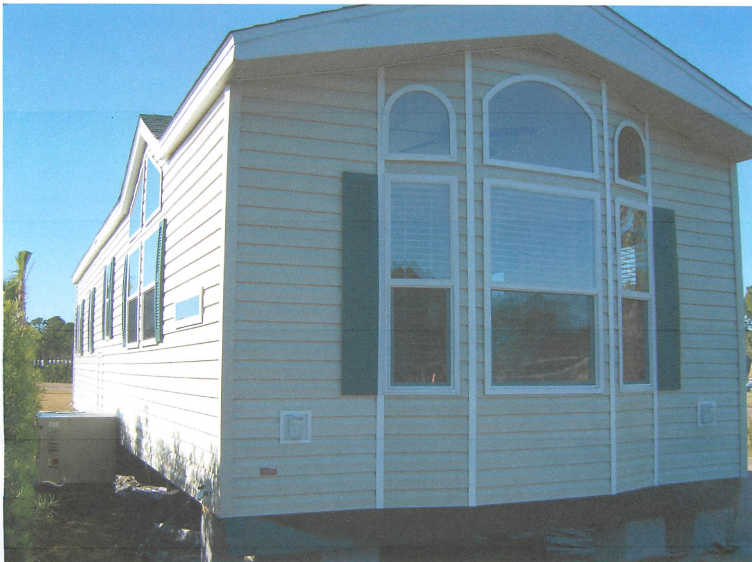
REAR VIEW 2/20/14

If submitting more photographs than will fit on the preceding page, affix the additional photographs below. Identify all photographs with: date taken; "Front View" and "Rear View"; and, if required, "Right Side View" and "Left Side View." When applicable, photographs must show the foundation with representative examples of the flood openings or vents, as indicated in Section A8.