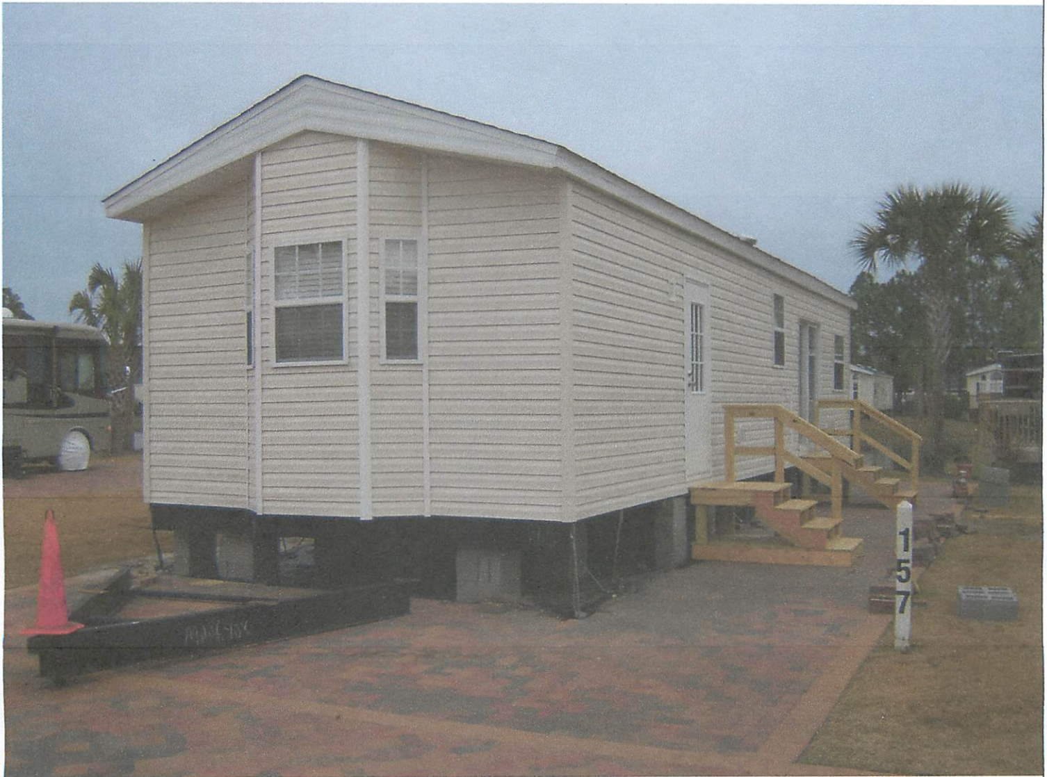
FRONT VIEW 2/20/14

If using the Elevation Certificate to obtain NFIP flood insurance, affix at least 2 building photographs below according to the instructions for Item A6. Identify all photographs with date taken; "Front View" and "Rear View"; and, if required, "Right Side View" and "Left Side View." When applicable, photographs must show the foundation with representative examples of the flood openings or vents, as indicated in Section A8. If submitting more photographs than will fit on this page, use the Continuation Page.