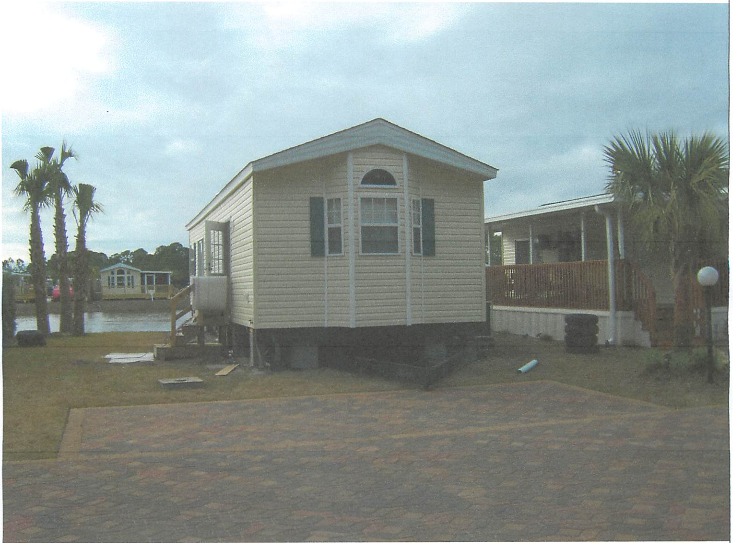
FRONT VIEW 2/20/14

If using the Elevation Certificate to obtain NFIP flood insurance, affix at least 2 building photographs below according to the instructions for Item A6. Identify all photographs with date taken; "Front View" and "Rear View"; and, if required, "Right Side View" and "Left Side View." When applicable, photographs must show the foundation with representative examples of the flood openings or vents, as indicated in Section A8. If submitting more photographs than will fit on this page, use the Continuation Page.