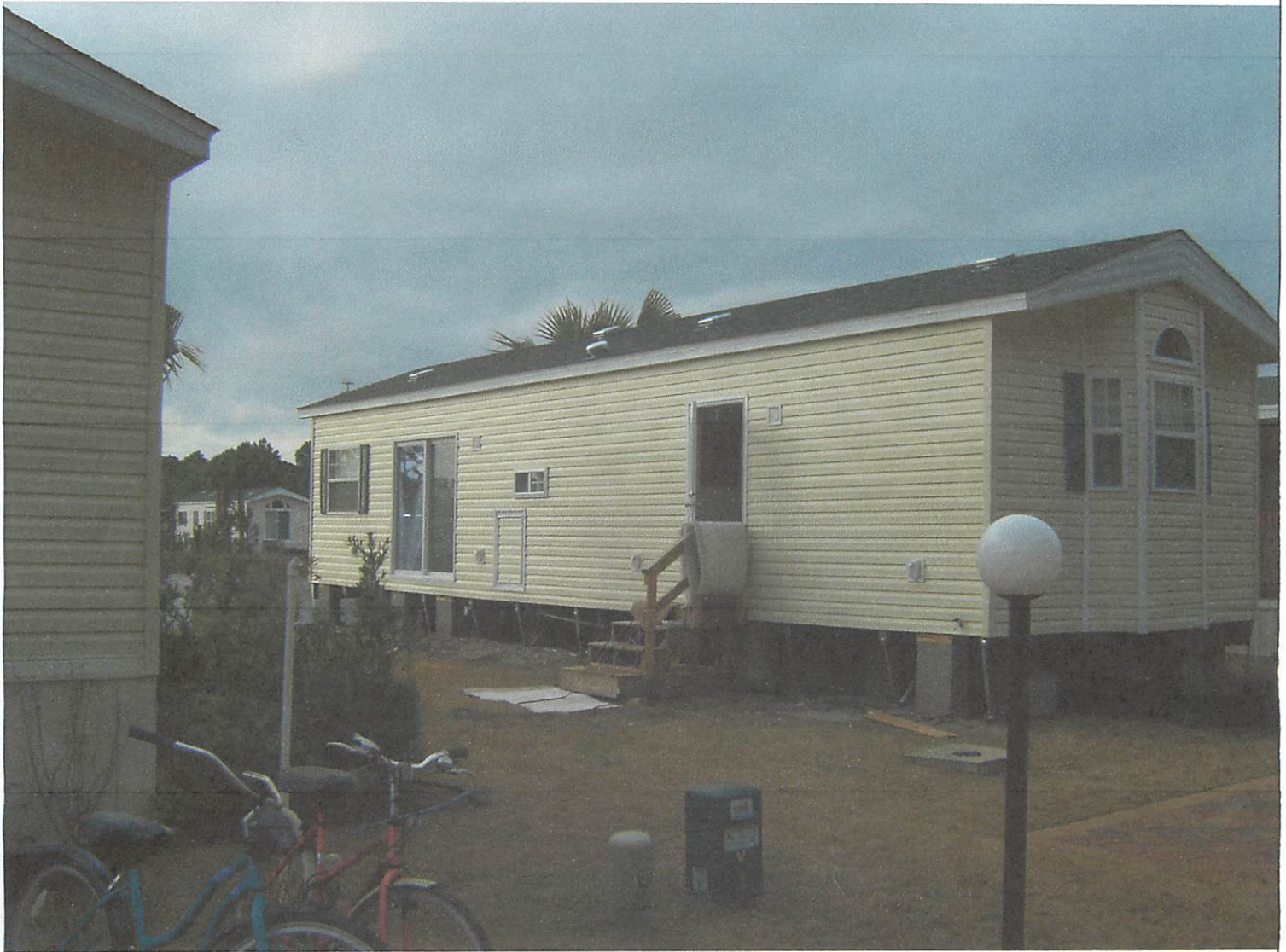
FRONT VIEW 02/16/2014

If using the Elevation Certificate to obtain NFIP flood insurance, affix at least 2 building photographs below according to the instructions for Item A6. Identify all photographs with date taken; "Front View" and "Rear View"; and, if required, "Right Side View" and "Left Side View." When applicable, photographs must show the foundation with representative examples of the flood openings or vents, as indicated in Section A8. If submitting more photographs than will fit on this page, use the Continuation Page.