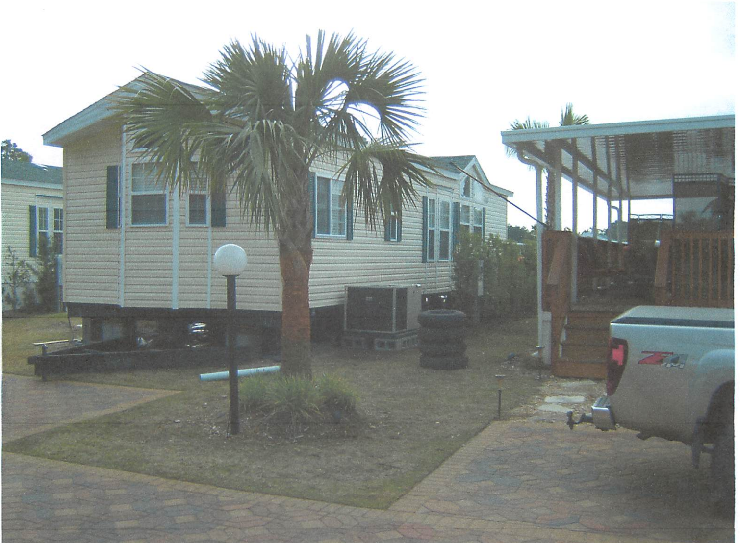
REAR VIEW 02/16/2014

If submitting more photographs than will fit on the preceding page, affix the additional photographs below. Identify all photographs with: date taken; "Front View" and "Rear View"; and, if required, "Right Side View" and "Left Side View." When applicable, photographs must show the foundation with representative examples of the flood openings or vents, as indicated in Section A8.