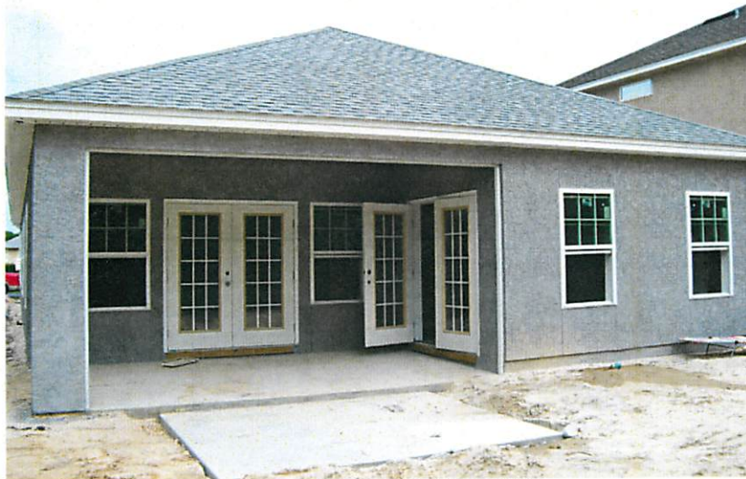
29 MAY 2014 -- REAR VIEW