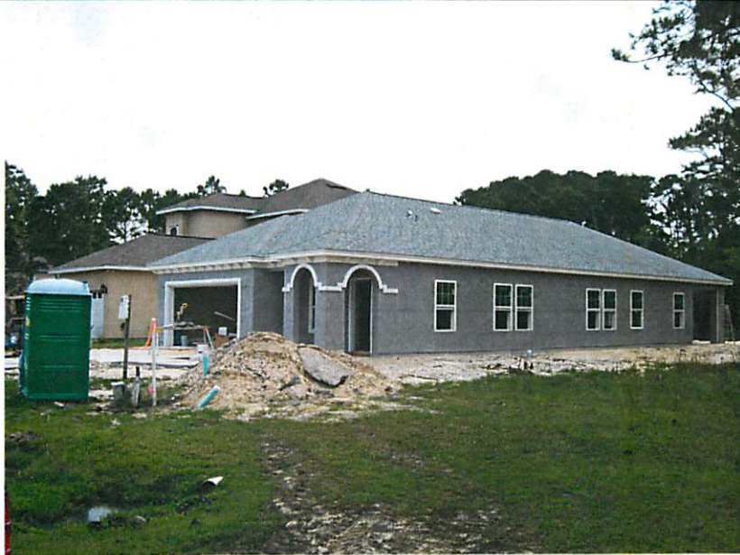
29 MAY 2014 -- FRONT VIEW

If using the Elevation Certificate to obtain NFIP flood insurance, affix at least 2 building photographs below according to the instructions for Item A6. Identify all photographs with date taken; "Front View" and "Rear View"; and, if required, "Right Side View" and "Left Side View." When applicable, photographs must show the foundation with representative examples of the flood openings or vents, as indicated in Section A8. If submitting more photographs than will fit on this page, use the Continuation Page.