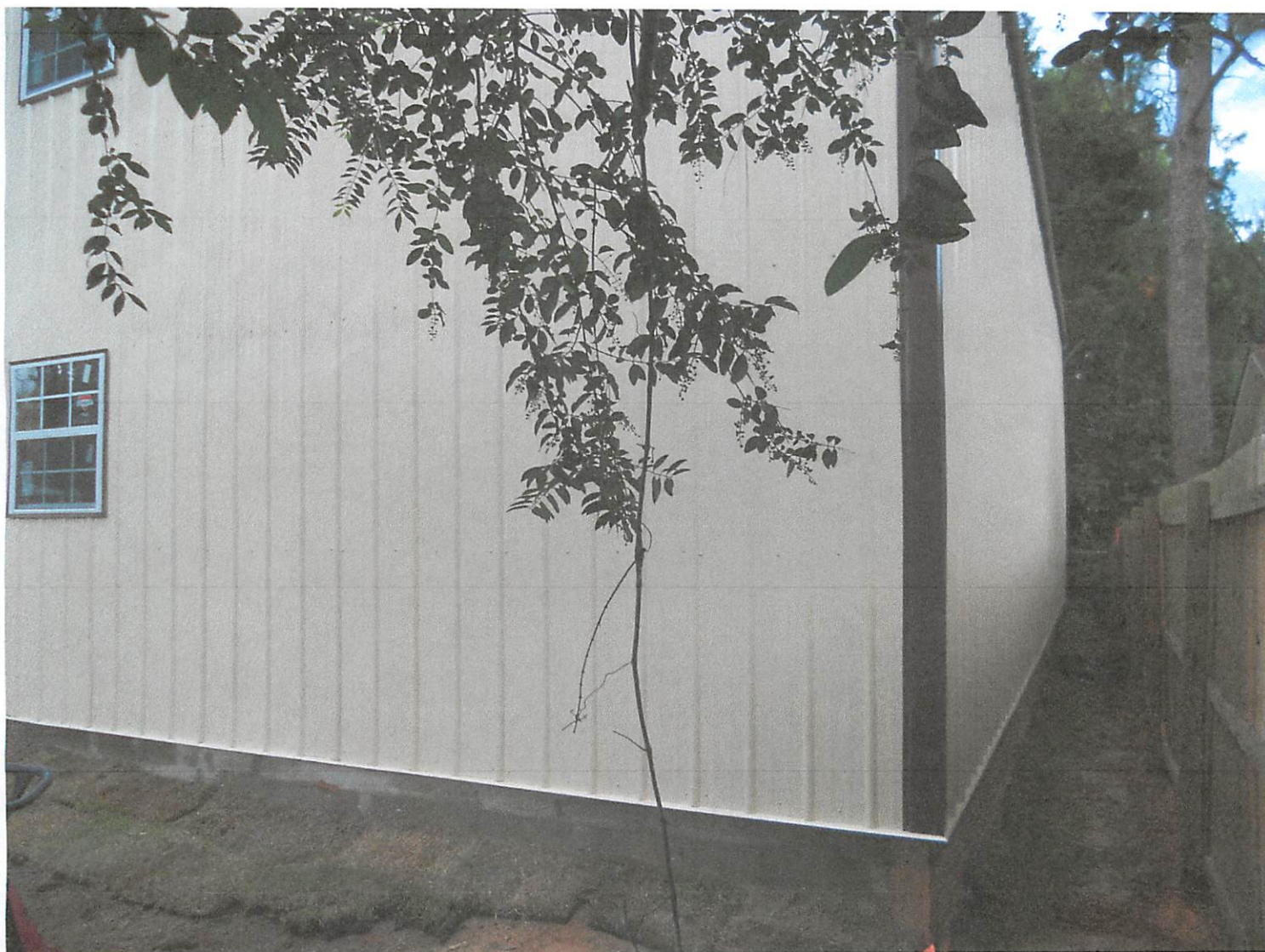
REAR VIEW 10/1/2014

If using the Elevation Certificate to obtain NFIP flood insurance, affix at least 2 building photographs below according to the instructions for Item A6. Identify all photographs with date taken; "Front View" and "Rear View"; and, if required, "Right Side View" and "Left Side View." When applicable, photographs must show the foundation with representative examples of the flood openings or vents, as indicated in Section A8. If submitting more photographs than will fit on this page, use the Continuation Page.