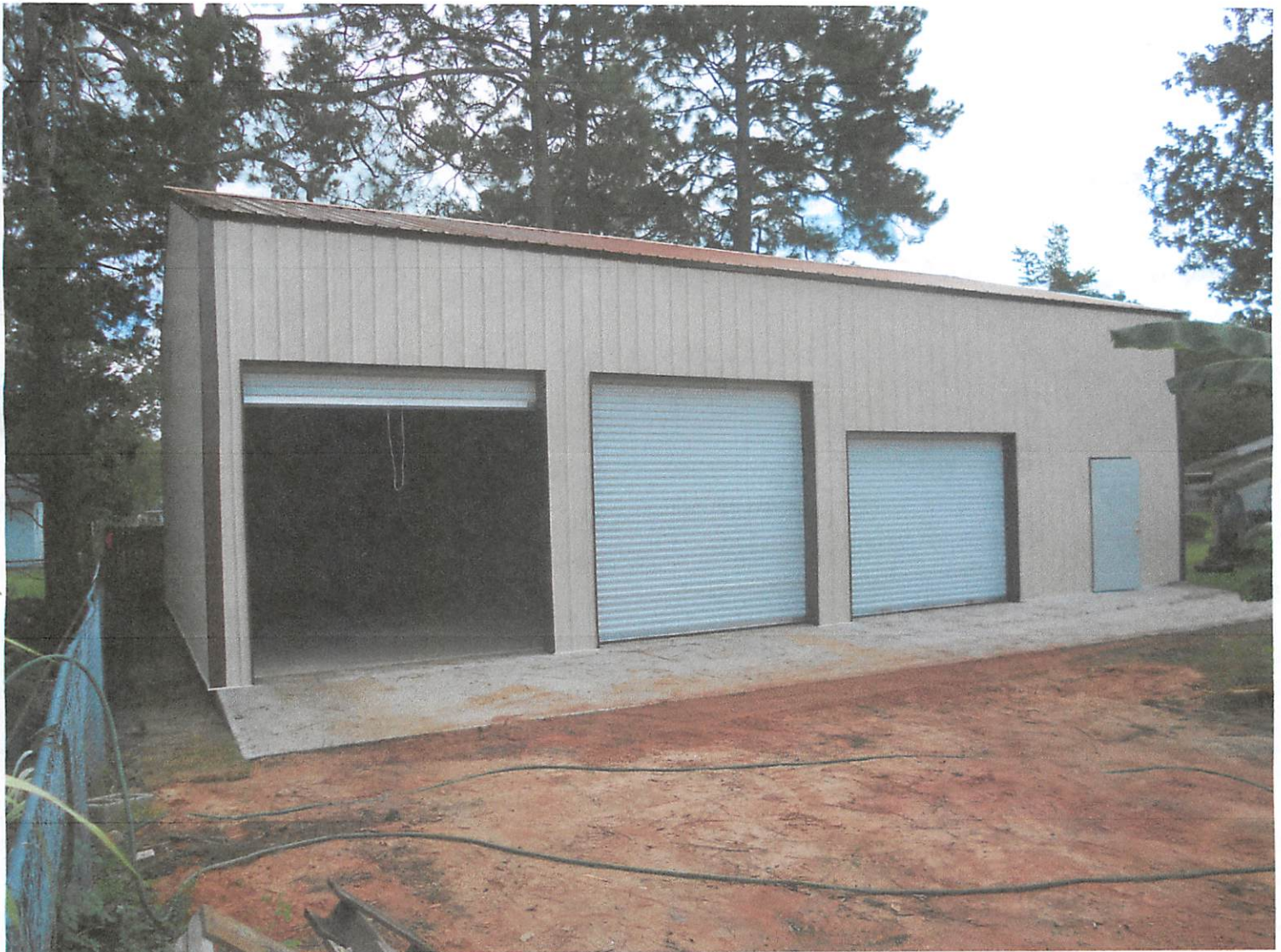
FRONT VIEW 10/1/2014

If using the Elevation Certificate to obtain NFIP flood insurance, affix at least 2 building photographs below according to the instructions for Item A6. Identify all photographs with date taken; "Front View" and "Rear View"; and, if required, "Right Side View" and "Left Side View." When applicable, photographs must show the foundation with representative examples of the flood openings or vents, as indicated in Section A8. If submitting more photographs than will fit on this page, use the Continuation Page.