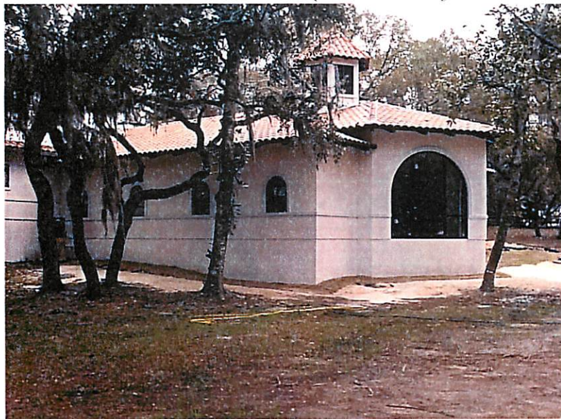
SIDE VIEW (03-17-14)