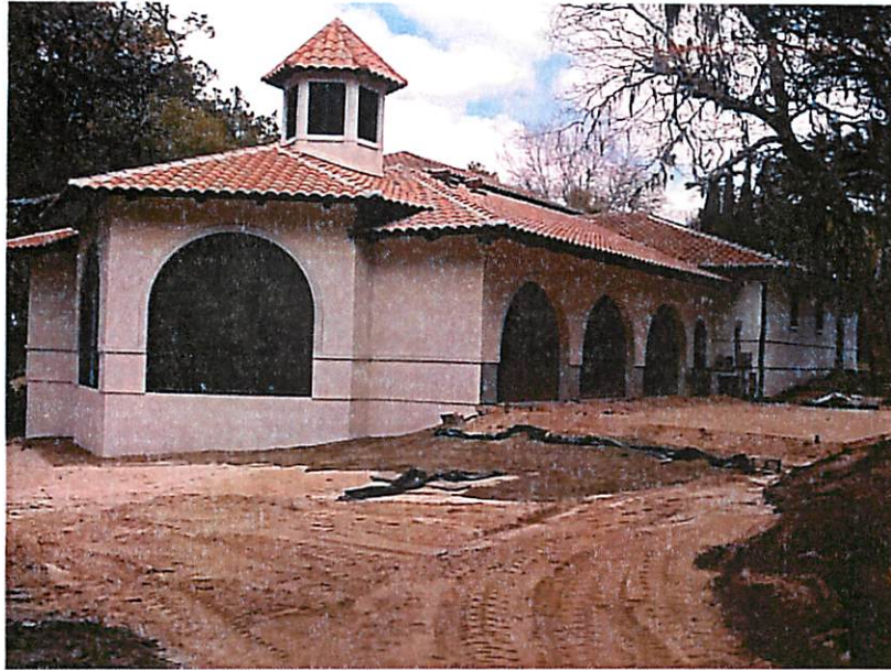
SIDE VIEW (03-17-14)

If using the Elevation Certificate to obtain NFIP flood insurance, affix at least two building photographs below according to the instructions for Item A6. Identify all photographs with: date taken; "Front View" and "Rear View"; and, if required, "Right Side View" and "Left Side View." If submitting more photographs than will fit on this page, use the Continuation Page, following.