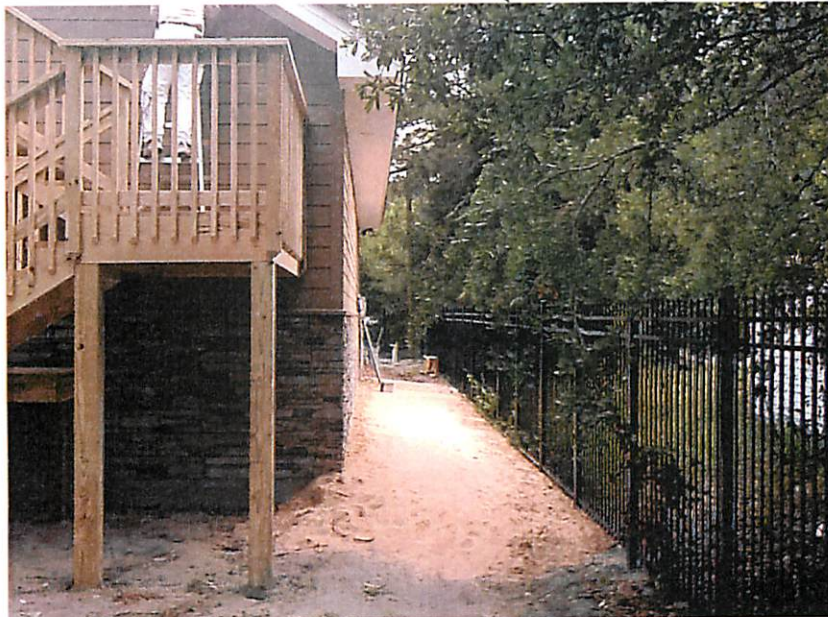
REAR VIEW (7-03-14)