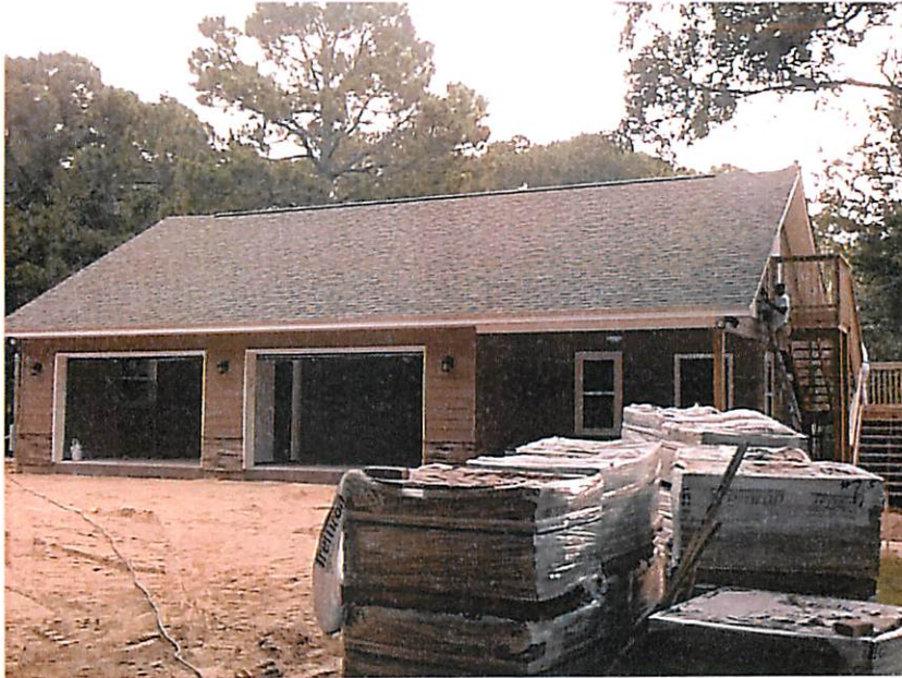
FRONT VIEW (7-03-14)

If using the Elevation Certificate to obtain NFIP flood insurance, affix at least two building photographs below according to the instructions for Item A6. Identify all photographs with: date taken; "Front View" and "Rear View"; and, if required, "Right Side View" and "Left Side View." If submitting more photographs than will fit on this page, use the Continuation Page, following.