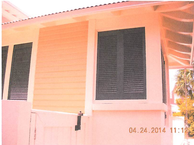
Right Side View 4.24.2014

If submitting more photographs than will fit on the preceding page, affix the additional photographs below. Identify all photographs with: date taken; "Front View" and "Rear View"; and, if required, "Right Side View" and "Left Side View." When applicable, photographs must show the foundation with representative examples of the flood openings or vents, as indicated in Section A8.