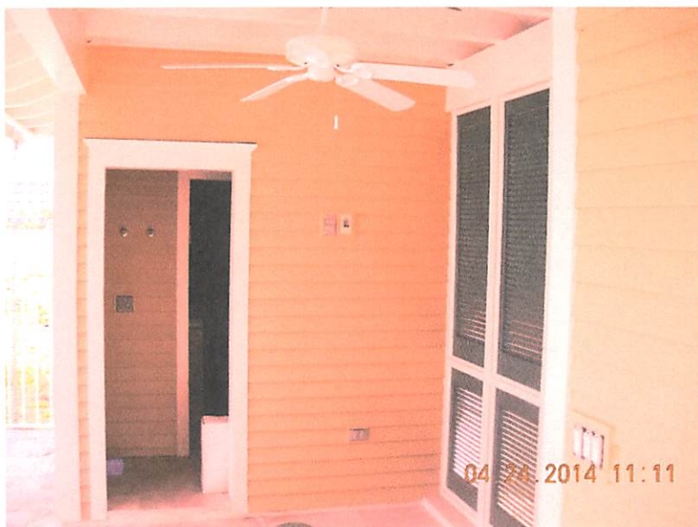
Front View 4.24.2014

If using the Elevation Certificate to obtain NFIP flood insurance, affix at least 2 building photographs below according to the instructions for Item A6. Identify all photographs with date taken; "Front View" and "Rear View"; and, if required, "Right Side View" and "Left Side View." When applicable, photographs must show the foundation with representative examples of the flood openings or vents, as indicated in Section A8. If submitting more photographs than will fit on this page, use the Continuation Page.