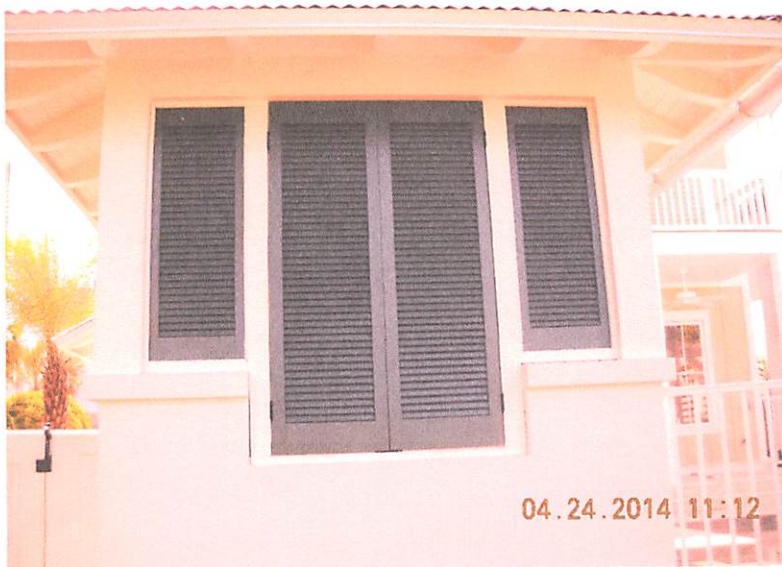
Rear View 4.24.2014