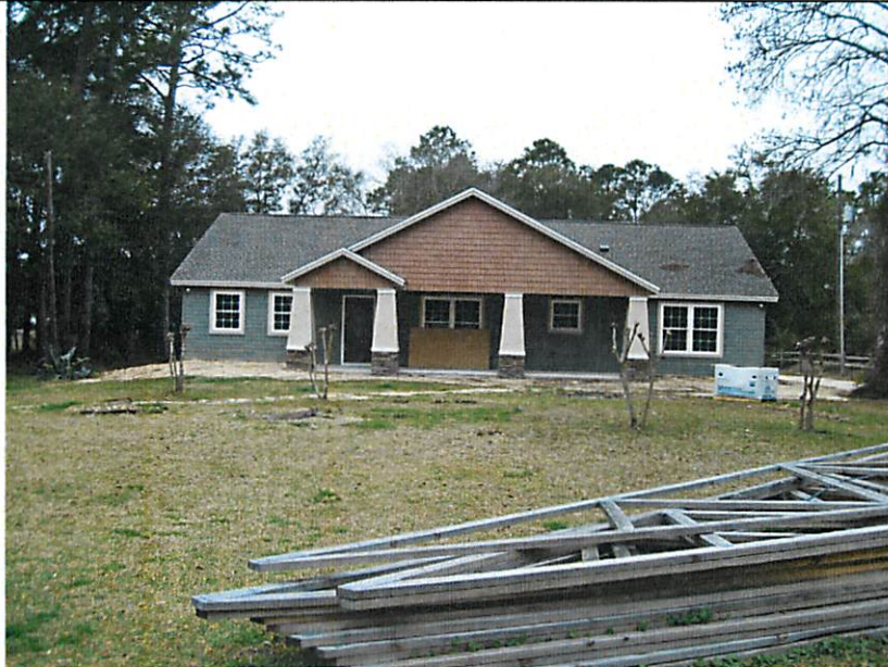
4 MARCH 2014 -- FRONT VIEW

If using the Elevation Certificate to obtain NFIP flood insurance, affix at least 2 building photographs below according to the instructions for Item A6. Identify all photographs with date taken; "Front View" and "Rear View"; and, if required, "Right Side View" and "Left Side View." When applicable, photographs must show the foundation with representative examples of the flood openings or vents, as indicated in Section A8. If submitting more photographs than will fit on this page, use the Continuation Page.