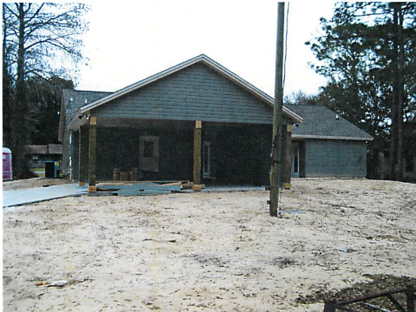
4 MARCH 2014 -- REAR VIEW