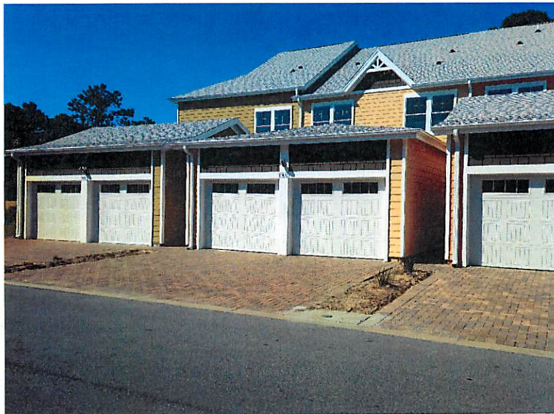
Rear View Photo Taken 10/20/14