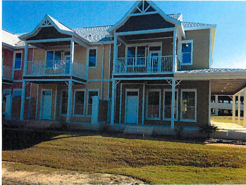
Front View Photo Taken 10/20/14

If using the Elevation Certificate to obtain NFIP flood insurance, affix at least 2 building photographs below according to the instructions for Item A6. Identify all photographs with date taken; "Front View" and "Rear View"; and, if required, "Right Side View" and "Left Side View." When applicable, photographs must show the foundation with representative examples of the flood openings or vents, as indicated in Section A8. If submitting more photographs than will fit on this page, use the Continuation Page.