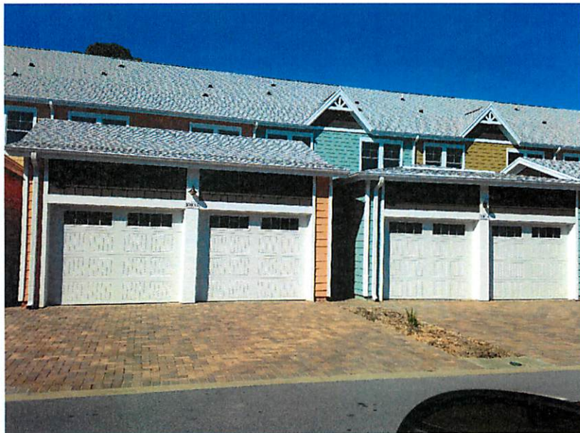
Rear View Photo Taken 10/20/14