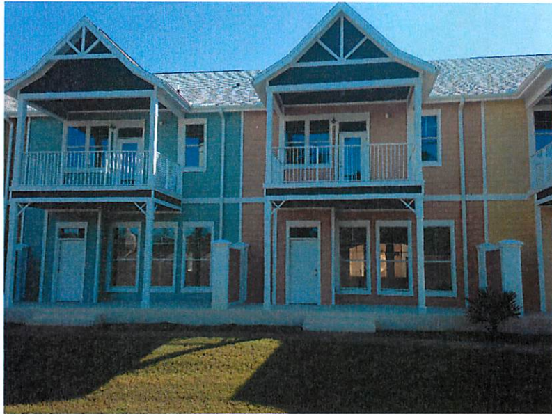
Front View Photo Taken 10/20/14

If using the Elevation Certificate to obtain NFIP flood insurance, affix at least 2 building photographs below according to the instructions for Item A6. Identify all photographs with date taken; "Front View" and "Rear View"; and, if required, "Right Side View" and "Left Side View." When applicable, photographs must show the foundation with representative examples of the flood openings or vents, as indicated in Section A8. If submitting more photographs than will fit on this page, use the Continuation Page.