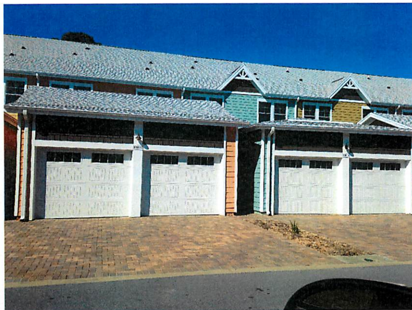
Rear View Photo Taken 10/20/14