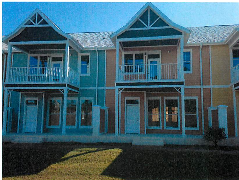
Front View Photo Taken 10/20/14

If using the Elevation Certificate to obtain NFIP flood insurance, affix at least 2 building photographs below according to the instructions for Item A6. Identify all photographs with date taken; "Front View" and "Rear View"; and, if required, "Right Side View" and "Left Side View." When applicable, photographs must show the foundation with representative examples of the flood openings or vents, as indicated in Section A8. If submitting more photographs than will fit on this page, use the Continuation Page.