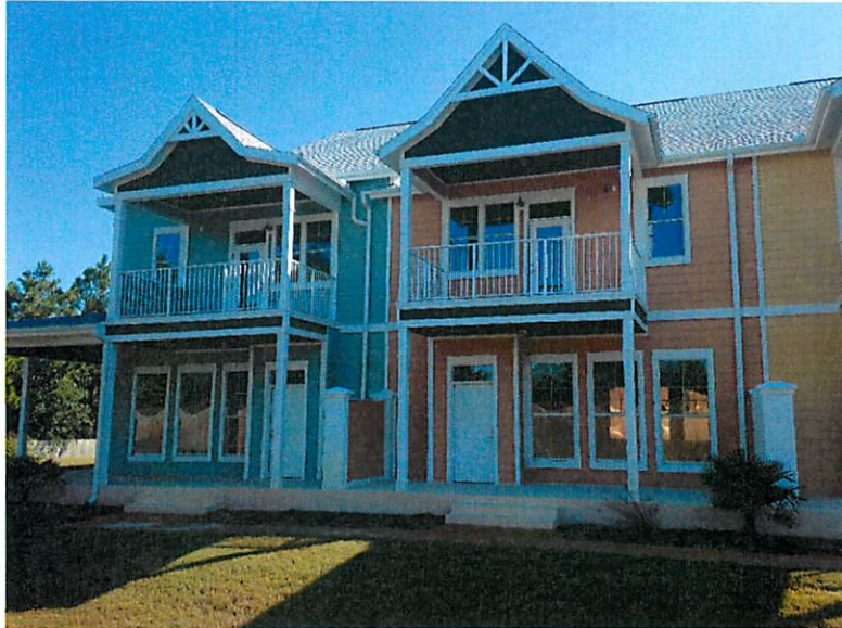
Front View Photo Taken 10/20/14

If using the Elevation Certificate to obtain NFIP flood insurance, affix at least 2 building photographs below according to the instructions for Item A6. Identify all photographs with date taken; "Front View" and "Rear View"; and, if required, "Right Side View" and "Left Side View." When applicable, photographs must show the foundation with representative examples of the flood openings or vents, as indicated in Section A8. If submitting more photographs than will fit on this page, use the Continuation Page.