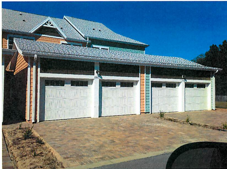
Rear View Photo Taken 10/20/14