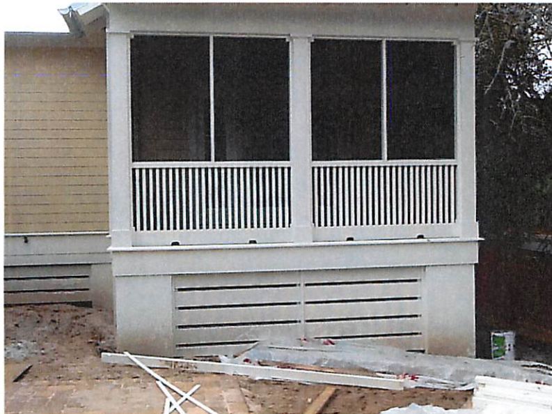
FRONT VIEW (04-17-15)

If using the Elevation Certificate to obtain NFIP flood insurance, affix at least two building photographs below according to the instructions for Item A6. Identify all photographs with: date taken; "Front View" and "Rear View"; and, if required, "Right Side View" and "Left Side View." If submitting more photographs than will fit on this page, use the Continuation Page, following.