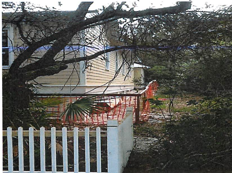
REAR VIEW (04-17-15)