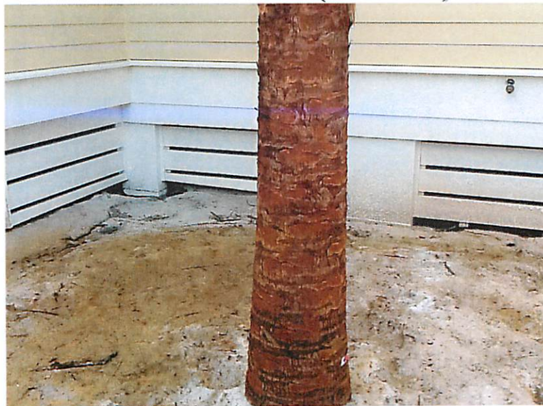
FRONT VIEW (04-17-15)