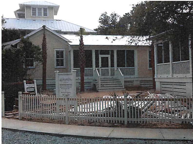
FRONT VIEW (04-17-15)

If using the Elevation Certificate to obtain NFIP flood insurance, affix at least two building photographs below according to the instructions for Item A6. Identify all photographs with: date taken; "Front View" and "Rear View"; and, if required, "Right Side View" and "Left Side View." If submitting more photographs than will fit on this page, use the Continuation Page, following.