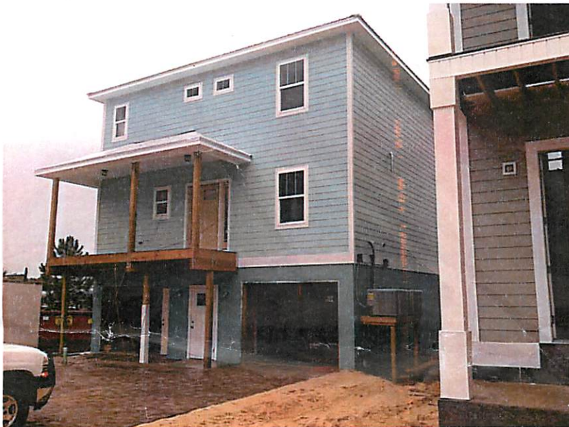
FRONT VIEW (12-22-14)

If using the Elevation Certificate to obtain NFIP flood insurance, affix at least two building photographs below according to the instructions for Item A6. Identify all photographs with: date taken; "Front View" and "Rear View"; and, if required, "Right Side View" and "Left Side View." If submitting more photographs than will fit on this page, use the Continuation Page, following.