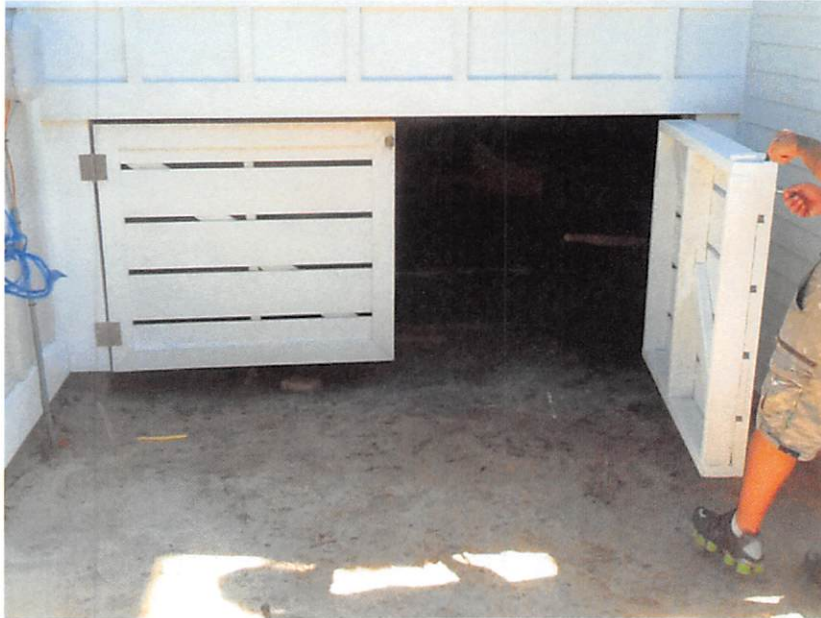
ENCLOSURE ACCESS (11-3-15)

If using the Elevation Certificate to obtain NFIP flood insurance, affix at least two building photographs below according to the instructions for Item A6. Identify all photographs with: date taken; "Front View" and "Rear View"; and, if required, "Right Side View" and "Left Side View." If submitting more photographs than will fit on this page, use the Continuation Page, following.