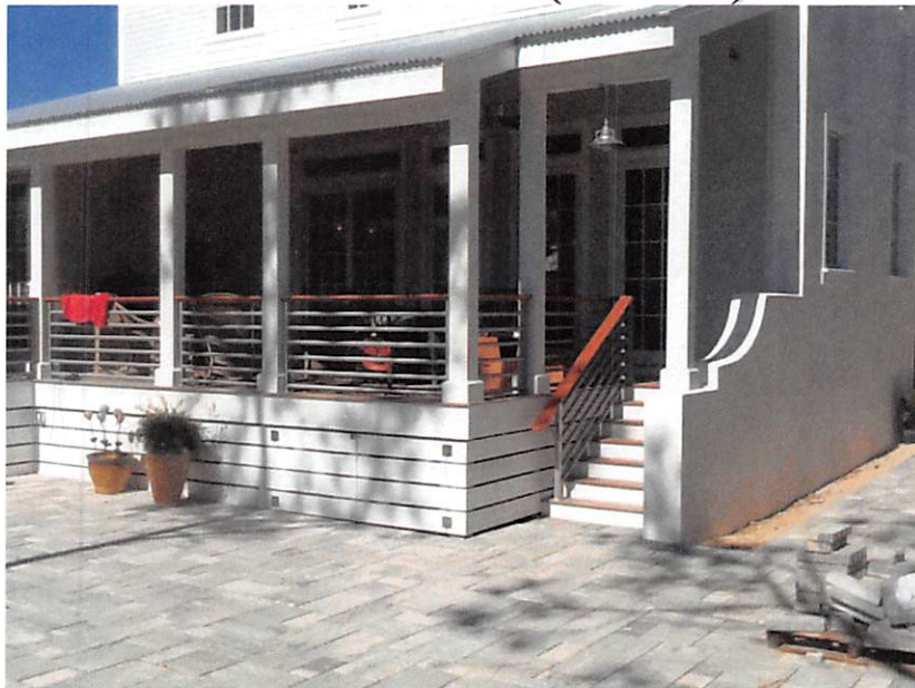
REAR VIEW (11-3-15)