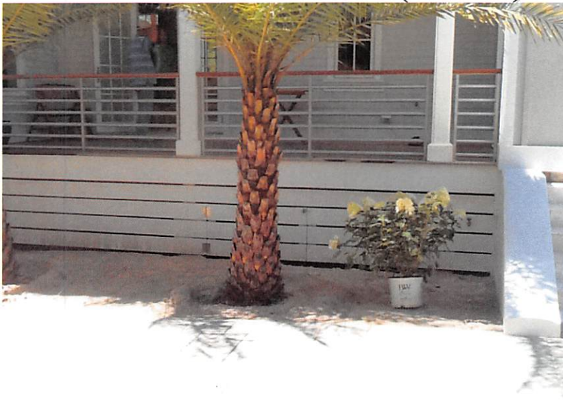
SIDE VIEW (11-3-15)