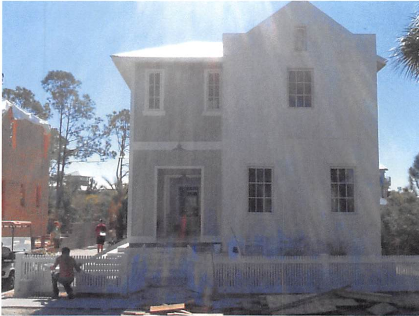
FRONT VIEW (11-3-15)

If using the Elevation Certificate to obtain NFIP flood insurance, affix at least two building photographs below according to the instructions for Item A6. Identify all photographs with: date taken; "Front View" and "Rear View"; and, if required, "Right Side View" and "Left Side View." If submitting more photographs than will fit on this page, use the Continuation Page, following.