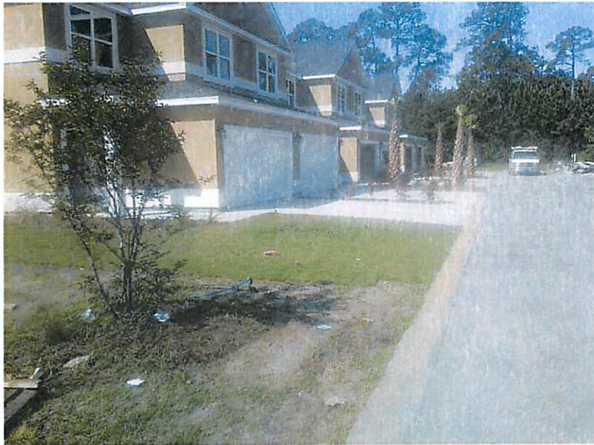
FRONT VIEW (04-7-15)

If using the Elevation Certificate to obtain NFIP flood insurance, affix at least two building photographs below according to the instructions for Item A6. Identify all photographs with: date taken; "Front View" and "Rear View"; and, if required, "Right Side View" and "Left Side View." If submitting more photographs than will fit on this page, use the Continuation Page, following.