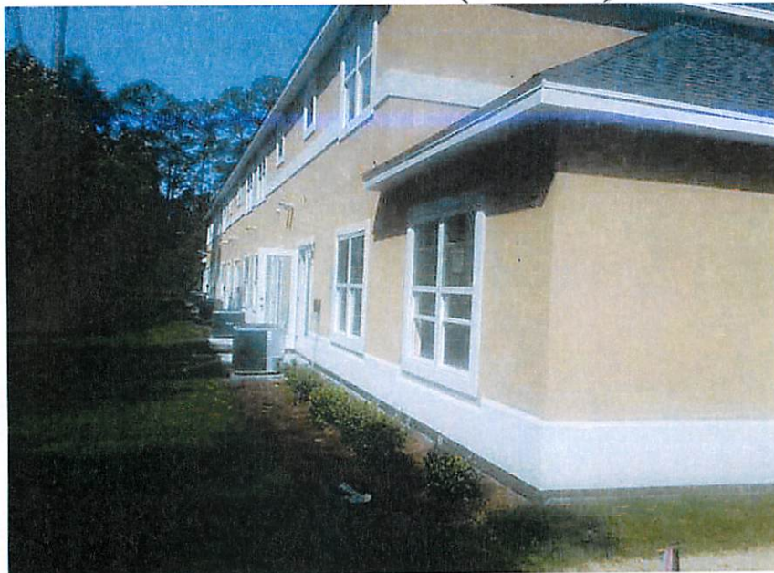
REAR VIEW (04-7-15)