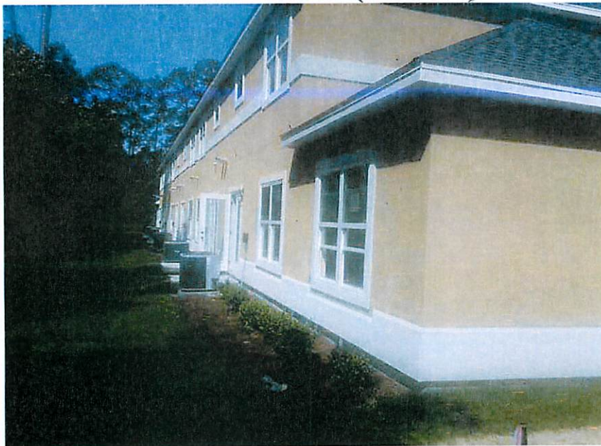
REAR VIEW (04-7-15)