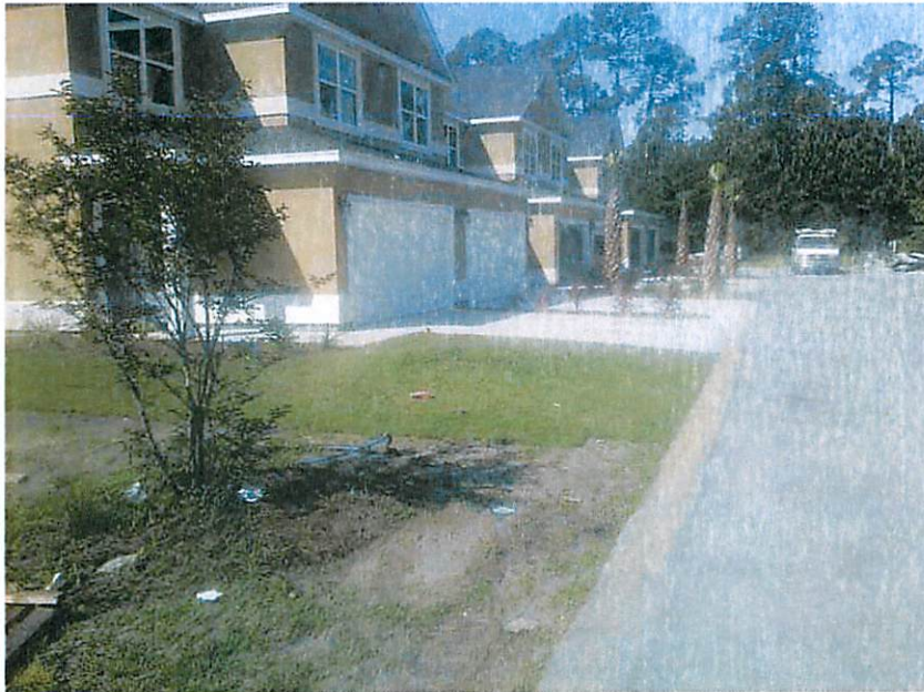
FRONT VIEW (04-7-15)

If using the Elevation Certificate to obtain NFIP flood insurance, affix at least two building photographs below according to the instructions for Item A6. Identify all photographs with: date taken; "Front View" and "Rear View"; and, if required, "Right Side View" and "Left Side View." If submitting more photographs than will fit on this page, use the Continuation Page, following.