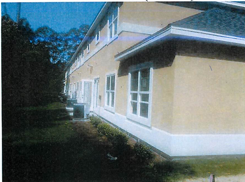
REAR VIEW (04-7-15)