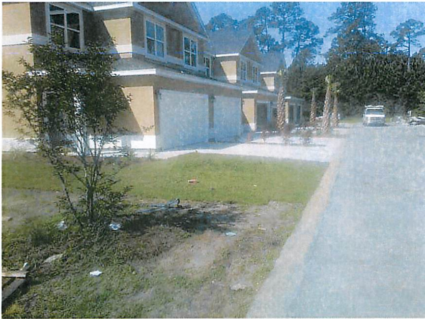
FRONT VIEW (04-7-15)

If using the Elevation Certificate to obtain NFIP flood insurance, affix at least two building photographs below according to the instructions for Item A6. Identify all photographs with: date taken; "Front View" and "Rear View"; and, if required, "Right Side View" and "Left Side View." If submitting more photographs than will fit on this page, use the Continuation Page, following.