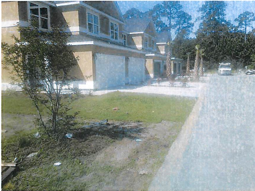
FRONT VIEW (04-7-15)

If using the Elevation Certificate to obtain NFIP flood insurance, affix at least two building photographs below according to the instructions for Item A6. Identify all photographs with: date taken; "Front View" and "Rear View"; and, if required, "Right Side View" and "Left Side View." If submitting more photographs than will fit on this page, use the Continuation Page, following.