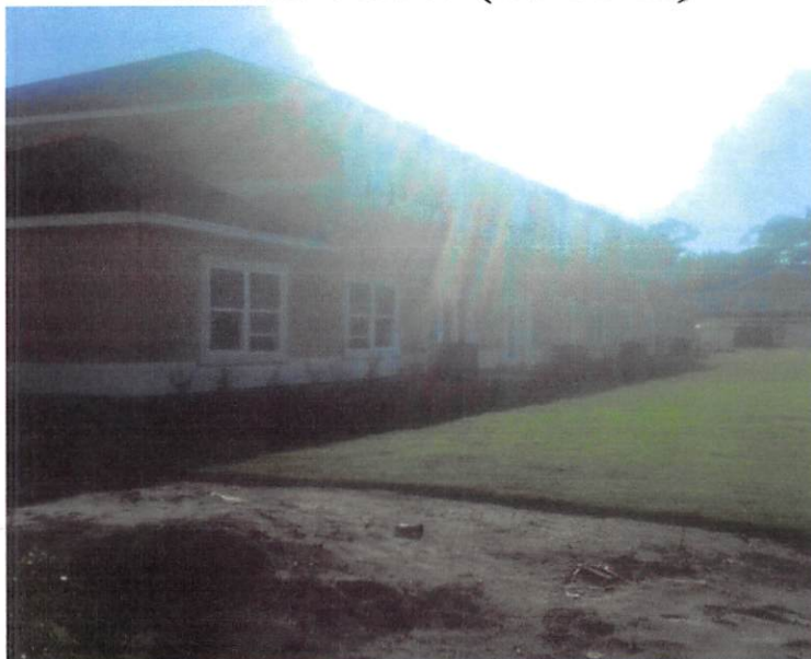
REAR VIEW (10-14-15)