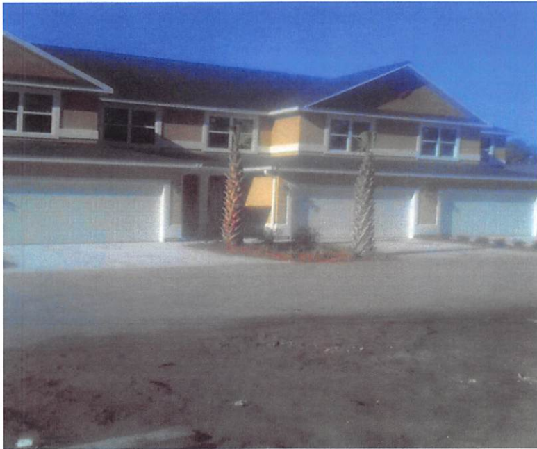
FRONT VIEW (10-14-15)

If using the Elevation Certificate to obtain NFIP flood insurance, affix at least two building photographs below according to the instructions for Item A6. Identify all photographs with: date taken; "Front View" and "Rear View"; and, if required, "Right Side View" and "Left Side View." If submitting more photographs than will fit on this page, use the Continuation Page, following.