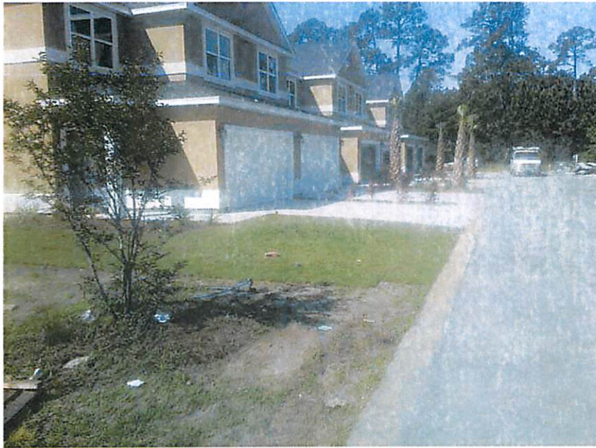
FRONT VIEW (04-7-15)

If using the Elevation Certificate to obtain NFIP flood insurance, affix at least two building photographs below according to the instructions for Item A6. Identify all photographs with: date taken; "Front View" and "Rear View"; and, if required, "Right Side View" and "Left Side View." If submitting more photographs than will fit on this page, use the Continuation Page, following.