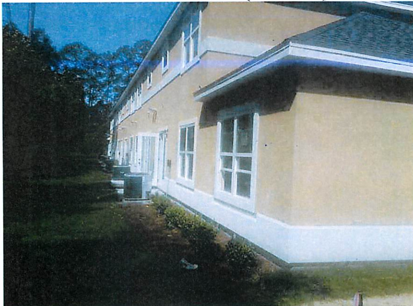
REAR VIEW (04-7-15)