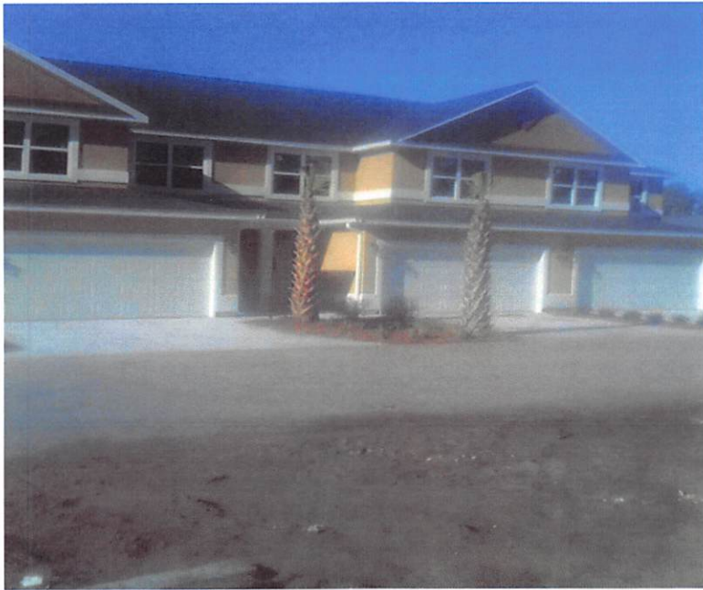
FRONT VIEW (10-14-15)

If using the Elevation Certificate to obtain NFIP flood insurance, affix at least two building photographs below according to the instructions for Item A6. Identify all photographs with: date taken; "Front View" and "Rear View"; and, if required, "Right Side View" and "Left Side View." If submitting more photographs than will fit on this page, use the Continuation Page, following.