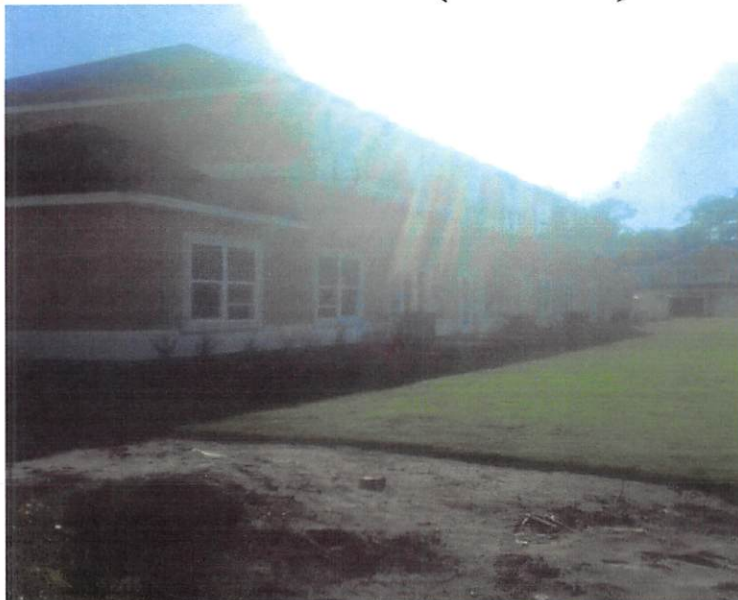
REAR VIEW (10-14-15)