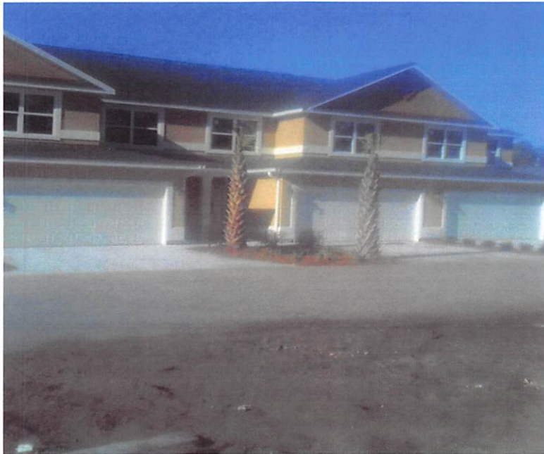
FRONT VIEW (10-14-15)

If using the Elevation Certificate to obtain NFIP flood insurance, affix at least two building photographs below according to the instructions for Item A6. Identify all photographs with: date taken; "Front View" and "Rear View"; and, if required, "Right Side View" and "Left Side View." If submitting more photographs than will fit on this page, use the Continuation Page, following.