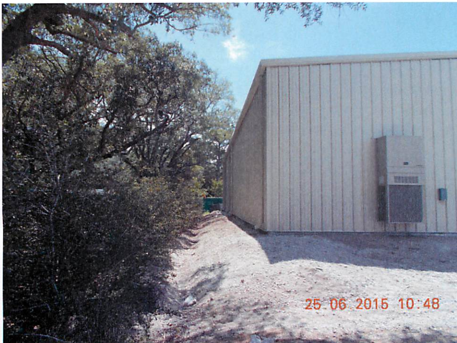
Rear View June 25, 2015