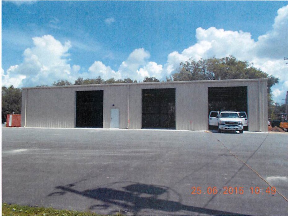
Front View June 25, 2015

If using the Elevation Certificate to obtain NFIP flood insurance, affix at least 2 building photographs below according to the instructions for Item A6. Identify all photographs with date taken; "Front View" and "Rear View"; and, if required, "Right Side View" and "Left Side View." When applicable, photographs must show the foundation with representative examples of the flood openings or vents, as indicated in Section A8. If submitting more photographs than will fit on this page, use the Continuation Page.