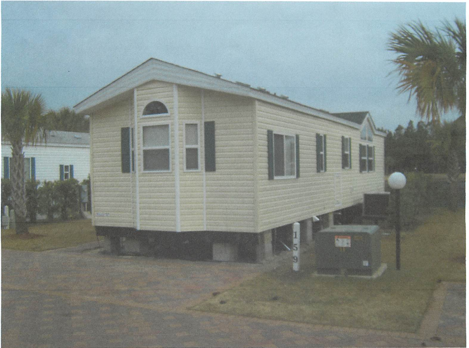
FRONT VIEW 2/24/2015

If using the Elevation Certificate to obtain NFIP flood insurance, affix at least 2 building photographs below according to the instructions for Item A6. Identify all photographs with date taken; "Front View" and "Rear View"; and, if required, "Right Side View" and "Left Side View." When applicable, photographs must show the foundation with representative examples of the flood openings or vents, as indicated in Section A8. If submitting more photographs than will fit on this page, use the Continuation Page.