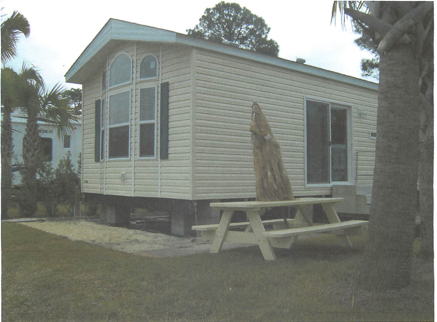
REAR VIEW 2/24/2015

If submitting more photographs than will fit on the preceding page, affix the additional photographs below. Identify all photographs with: date taken; "Front View" and "Rear View"; and, if required, "Right Side View" and "Left Side View." When applicable, photographs must show the foundation with representative examples of the flood openings or vents, as indicated in Section A8.