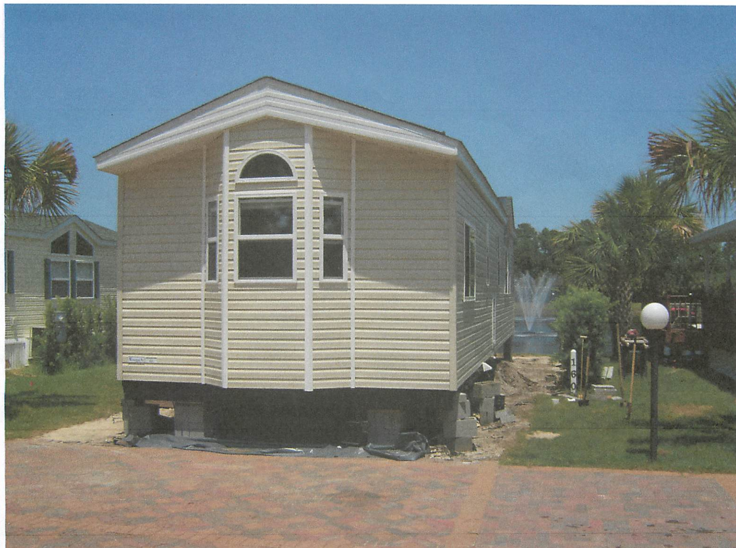
FRONT VIEW 8/13/15

If using the Elevation Certificate to obtain NFIP flood insurance, affix at least 2 building photographs below according to the instructions for Item A6. Identify all photographs with date taken; "Front View" and "Rear View"; and, if required, "Right Side View" and "Left Side View." When applicable, photographs must show the foundation with representative examples of the flood openings or vents, as indicated in Section A8. If submitting more photographs than will fit on this page, use the Continuation Page.