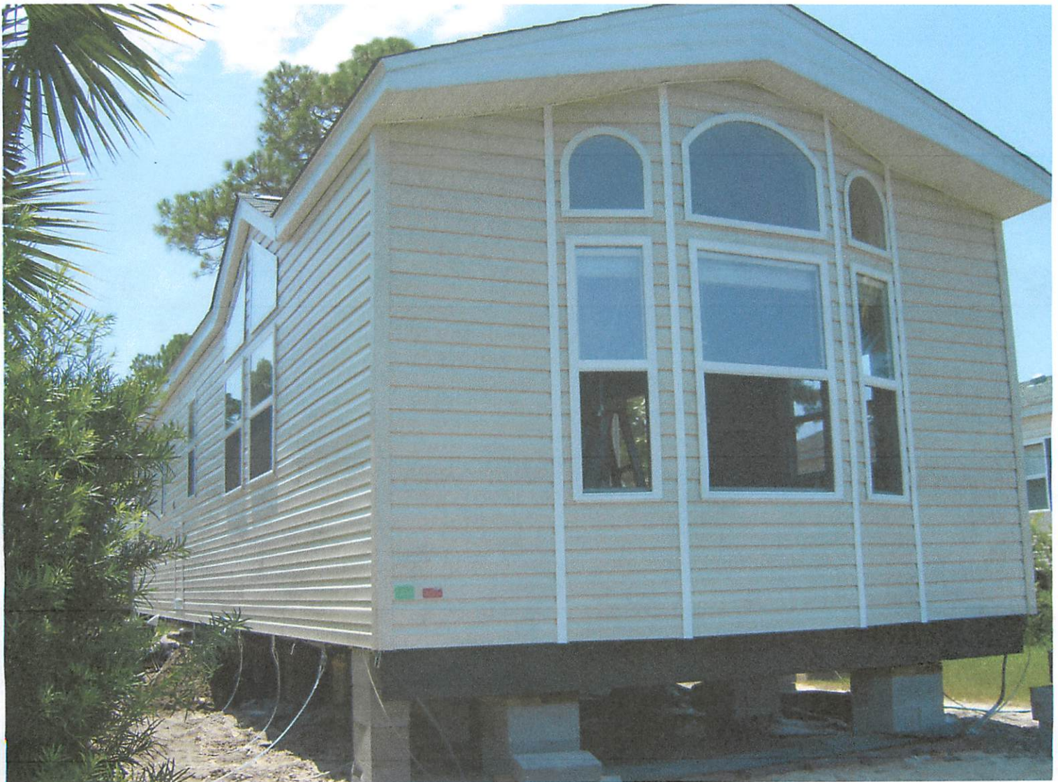
REAR VIEW 8/13/15

If submitting more photographs than will fit on the preceding page, affix the additional photographs below. Identify all photographs with: date taken; "Front View" and "Rear View"; and, if required, "Right Side View" and "Left Side View." When applicable, photographs must show the foundation with representative examples of the flood openings or vents, as indicated in Section A8.