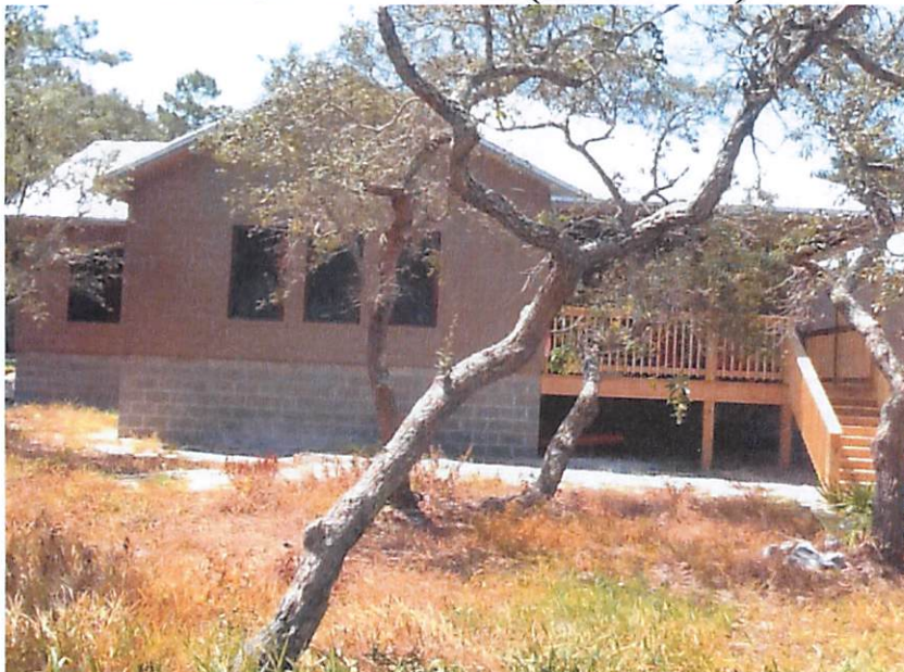
REAR VIEW (07-20-15)