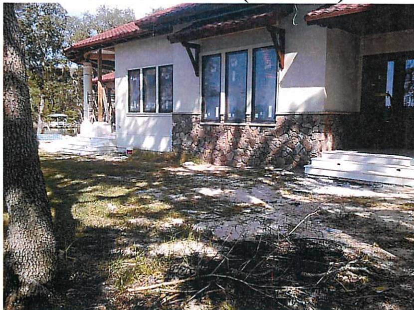
REAR VIEW (10-06-14)