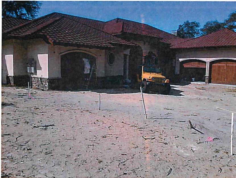
FRONT VIEW (10-06-14)

If using the Elevation Certificate to obtain NFIP flood insurance, affix at least two building photographs below according to the instructions for Item A6. Identify all photographs with: date taken; "Front View" and "Rear View"; and, if required, "Right Side View" and "Left Side View." If submitting more photographs than will fit on this page, use the Continuation Page, following.