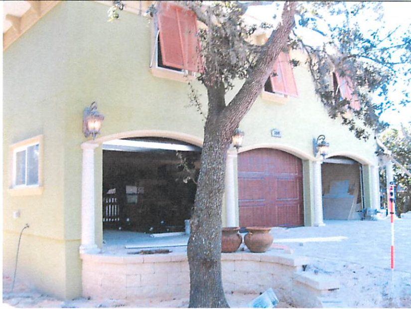
6 FEBRUARY 2015 -- FRONT VIEW

If using the Elevation Certificate to obtain NFIP flood insurance, affix at least 2 building photographs below according to the instructions for Item A6. Identify all photographs with date taken; "Front View" and "Rear View"; and, if required, "Right Side View" and "Left Side View." When applicable, photographs must show the foundation with representative examples of the flood openings or vents, as indicated in Section A8. If submitting more photographs than will fit on this page, use the Continuation Page.