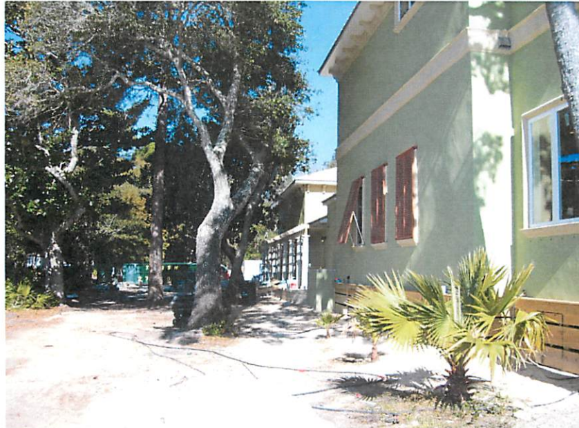
6 FEBRUARY 2015 -- REAR VIEW