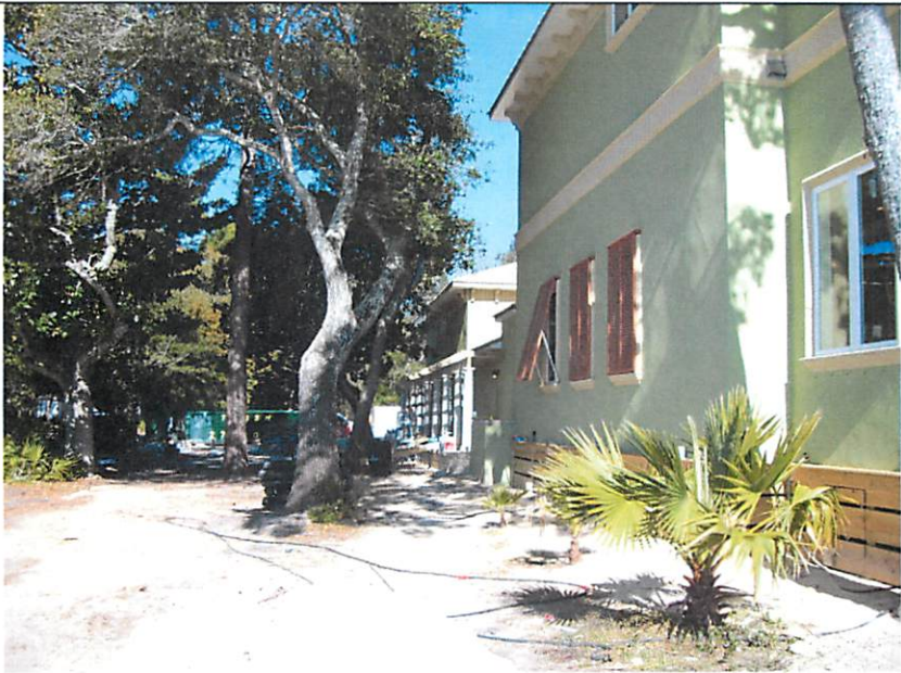
6 FEBRUARY 2015 -- FRONT VIEW

If using the Elevation Certificate to obtain NFIP flood insurance, affix at least 2 building photographs below according to the instructions for Item A6. Identify all photographs with date taken; "Front View" and "Rear View"; and, if required, "Right Side View" and "Left Side View." When applicable, photographs must show the foundation with representative examples of the flood openings or vents, as indicated in Section A8. If submitting more photographs than will fit on this page, use the Continuation Page.