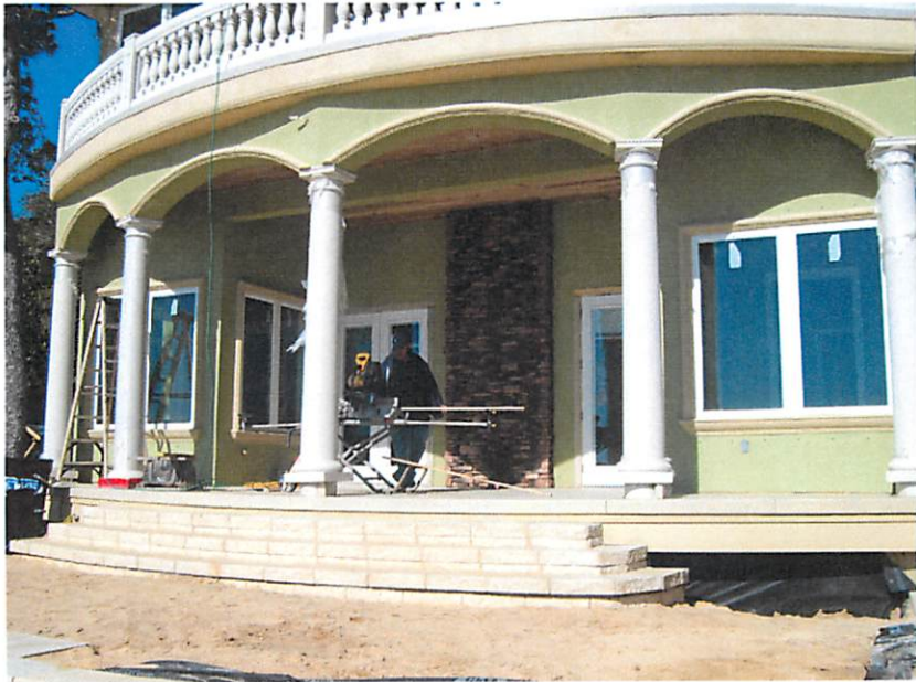
6 FEBRUARY 2015 -- REAR VIEW