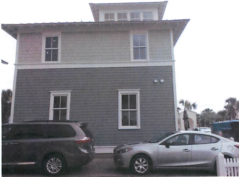
REAR VIEW (06-09-15)