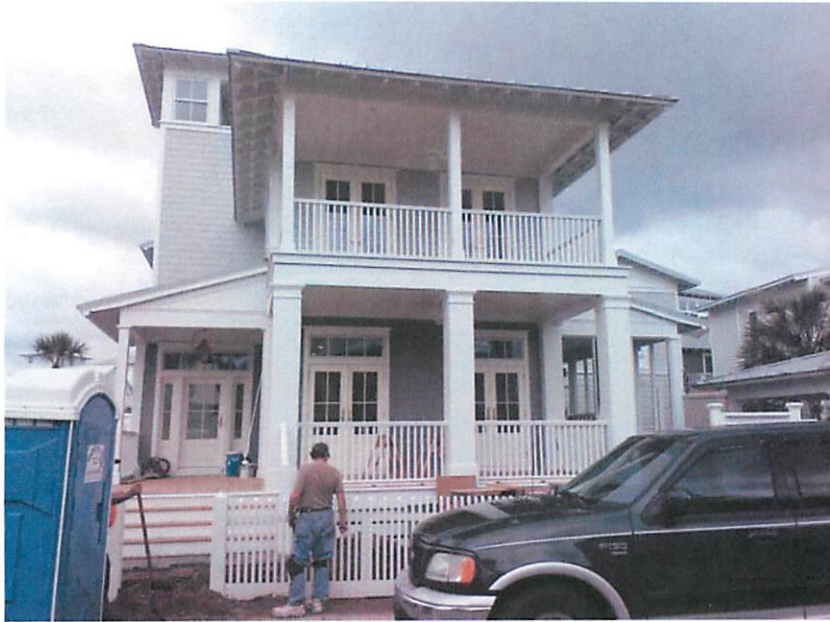
FRONT VIEW (06-09-15)

If using the Elevation Certificate to obtain NFIP flood insurance, affix at least two building photographs below according to the instructions for Item A6. Identify all photographs with: date taken; "Front View" and "Rear View"; and, if required, "Right Side View" and "Left Side View." If submitting more photographs than will fit on this page, use the Continuation Page, following.