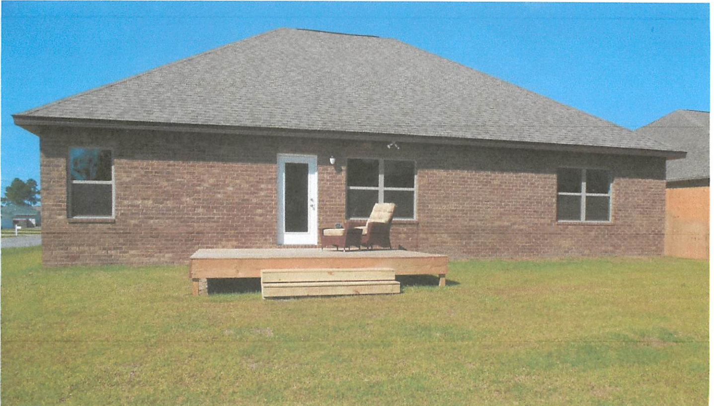
Left & Front View