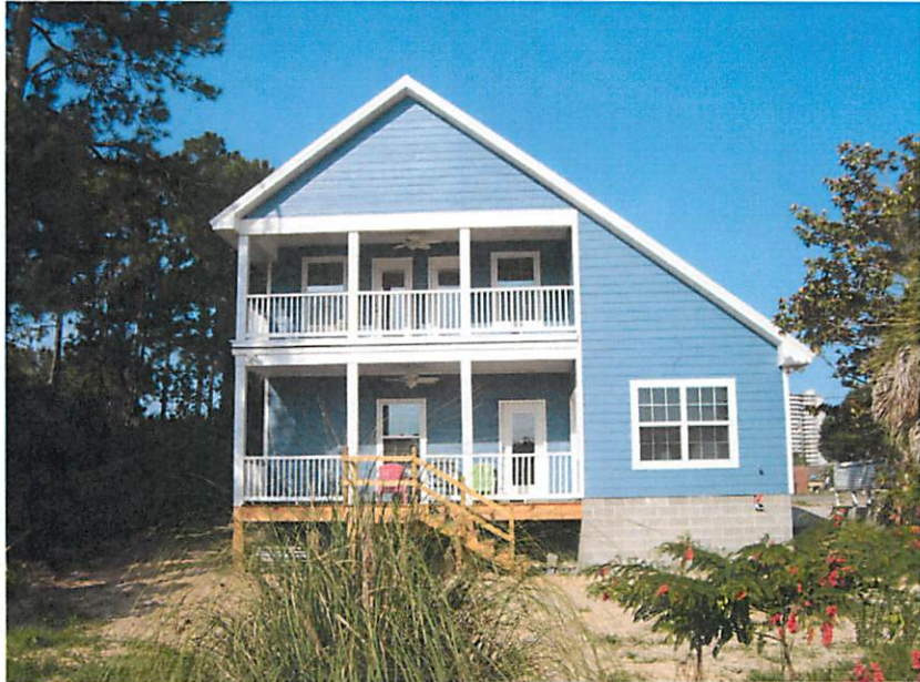
23 JUNE 2015 -- REAR VIEW