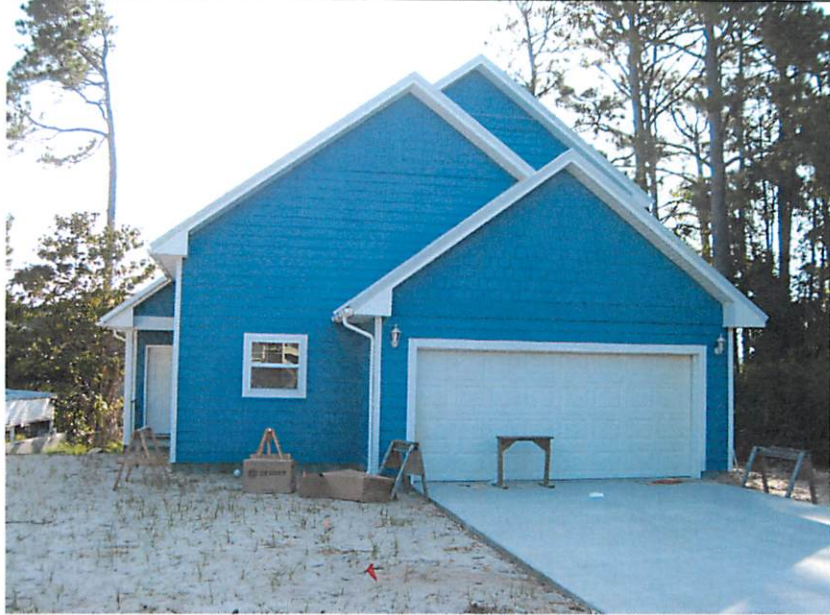
23 JUNE 2015 -- FRONT VIEW

If using the Elevation Certificate to obtain NFIP flood insurance, affix at least 2 building photographs below according to the instructions for Item A6. Identify all photographs with date taken; "Front View" and "Rear View"; and, if required, "Right Side View" and "Left Side View." When applicable, photographs must show the foundation with representative examples of the flood openings or vents, as indicated in Section A8. If submitting more photographs than will fit on this page, use the Continuation Page.